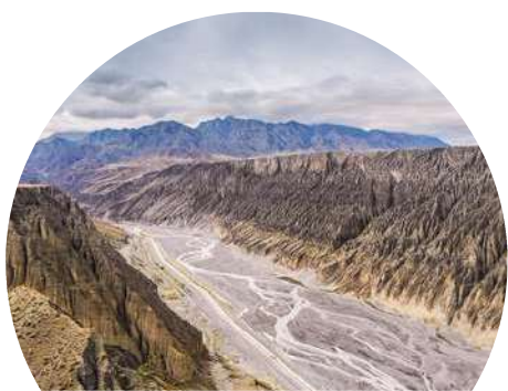
Dushanzi Grand Canyon