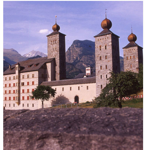
Brig, Switzerland STOCKALPERSCHLOSS 斯托卡尔珀城堡

For reservations or any other inquiries, please contact our staff.