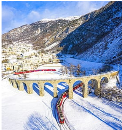
Brusio, Switzerland BRUSIO SPIRAL VIADUCT 布鲁西奥螺旋高架桥