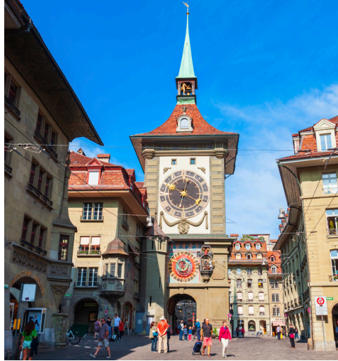
Bern, Switzerland ZYTGLOGGE CLOCK TOWER 钟楼