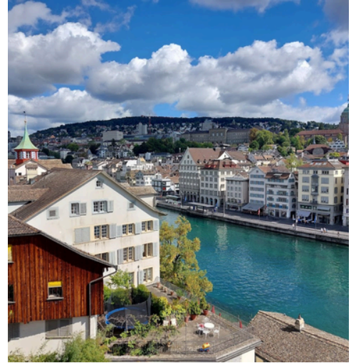
Zurich, Switzerland LINDENHOF PARK 林登霍夫公园