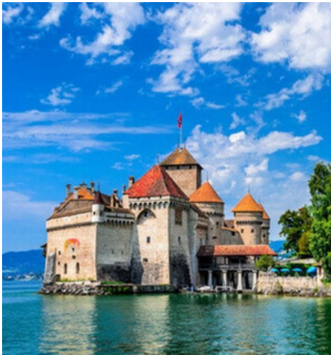
Veytaux, Switzerland CHILLON CASTLE 希永城堡