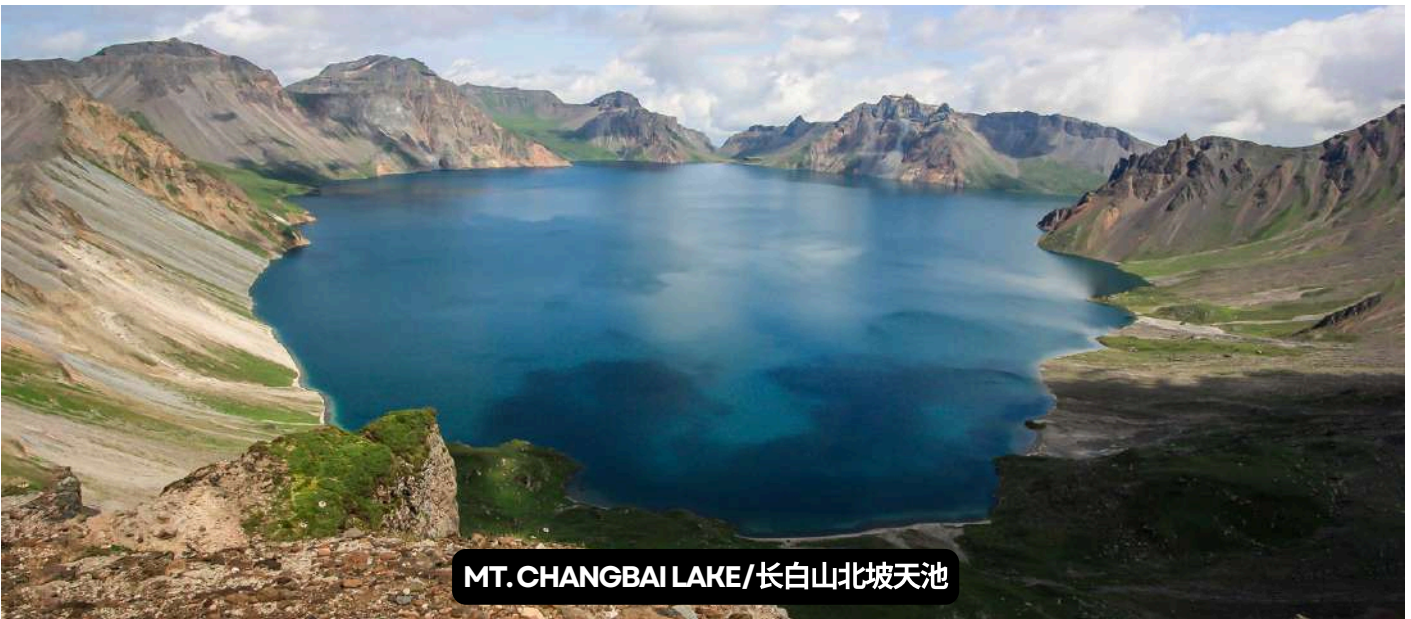
MT. CHANGBAI LAKE/长白山北坡天池

Disclaimer: Due to travel restrictions related to the COVID-19 pandemic, local religious holidays, public holidays, weather conditions, transportation, natural disasters, or other unforeseen circumstances, SEARCH TRAVEL reserves the right to make necessary adjustments to the itinerary (including changes in the order of sightseeing) to ensure the smooth progress of the trip, with or without prior notice. Please note that if the travel itinerary is affected by the aforementioned issues, refunds or replacements will not be provided. Images are for reference only. In case of any discrepancies between the Chinese and English versions of the itinerary, the Chinese version shall prevail.