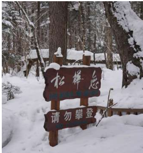
Jilin, Harbin PINE-BIRCH ROMANCE 松桦恋