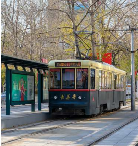
Jilin, Changchun RETRO TRAM 长春号复古电车