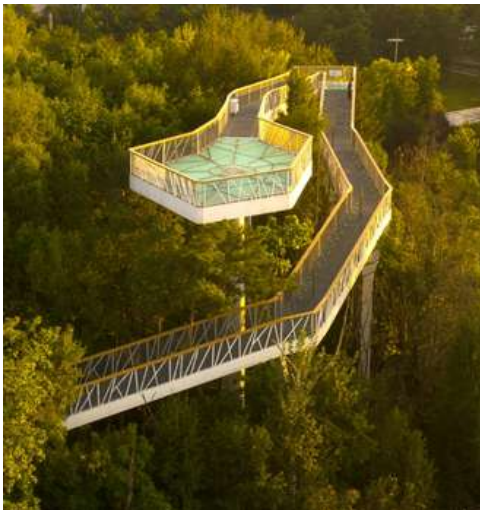
Jilin, Changbaishan BEAUTY PINE PARK 美人松公园