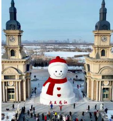
Heilongjiang, Harbin FAMOUS BIG SNOWMAN 网红大雪人