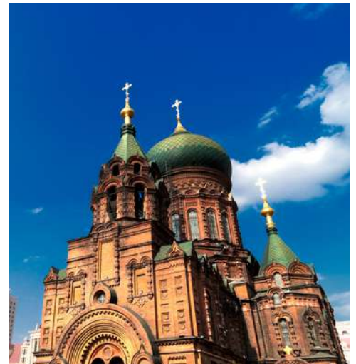
Heilongjiang, Harbin SOPHIA CHURCH SQUARE 圣索菲亚教堂广场

For reservations or any other inquiries, please contact our staff.