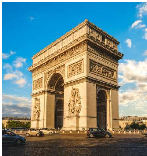
Paris, France ARC DE TRIOMPHE 凯旋门