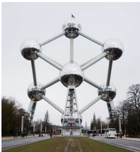
Brussels, Belgium ATOMIUM 原子球塔