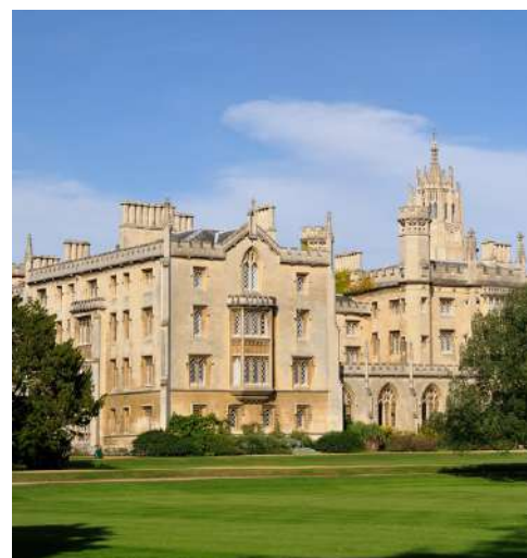
Cambridge, England ST JOHN'S COLLEGE 圣约翰学院

For reservations or any other inquiries, please contact our staff.