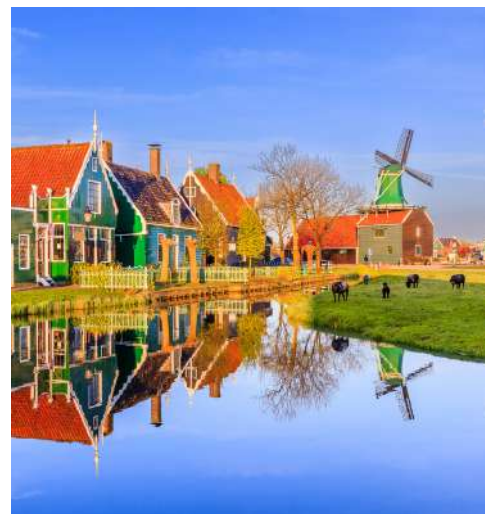
Amsterdam, Netherlands ZAANSE SCHANS 扎恩塞·斯汉斯