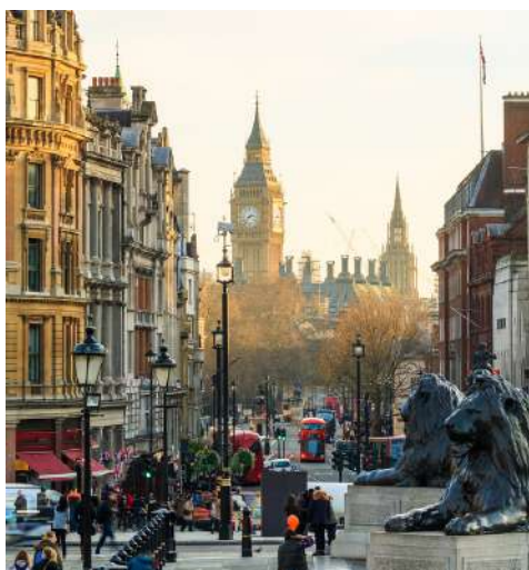
London, England TRAFALGAR SQUARE 特拉法加广场