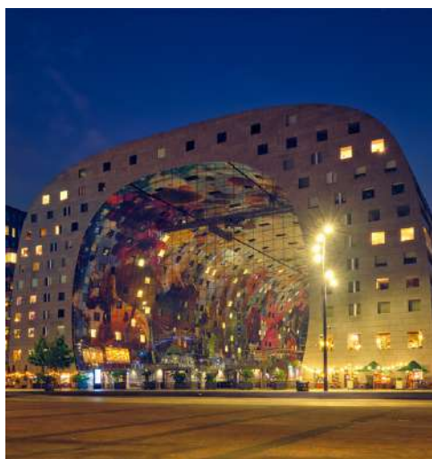
Rotterdam, Netherlands MARKTHAL 马克塔尔市场