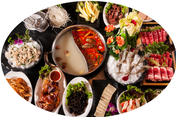
Chongqing Yuanyang Hotpot 重庆鸳鸯火锅