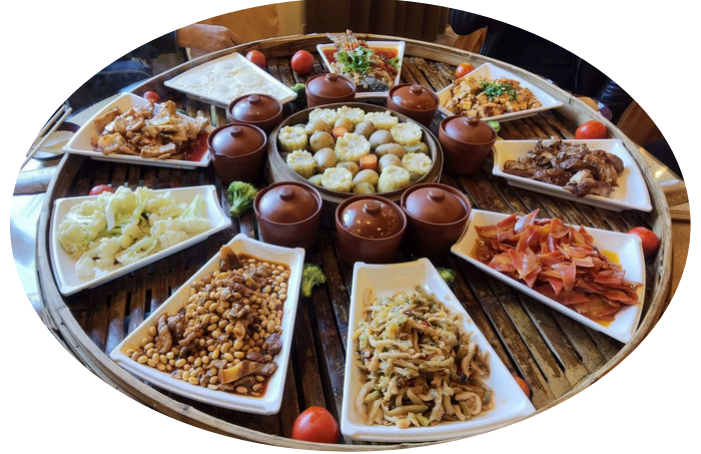
Wulong Bamboo Tube Cuisine 武隆竹筒美食

For reservations or any other inquiries, please contact our staff.