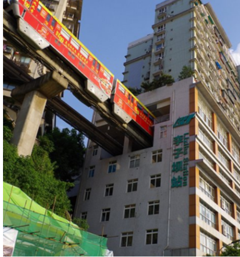
LIZIBA RAIL STATION 李子坝轻轨站