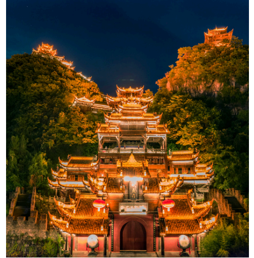
CHIYOU JIULI CITY 蚩尤九黎城