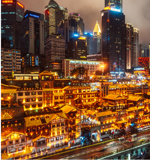
HONG YA DONG 洪崖洞