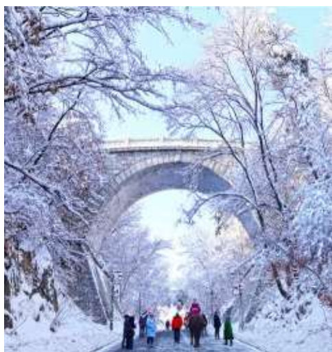
Jilin, Harbin BEISHAN PARK 北山公园