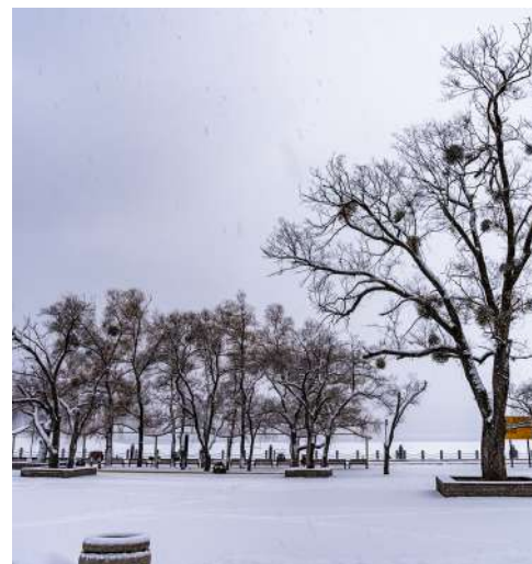
Jingpo, Harbin JINGPO LAKE SCENIC AREA 镜泊湖风景区