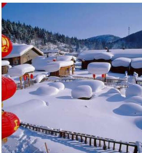
Heilongjiang, Harbin SNOW VILLAGE 雪乡