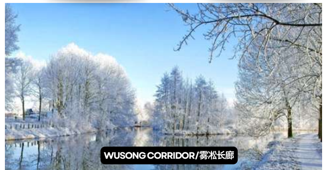
WUSONG CORRIDOR / 雾凇长廊

• SGD 64 Per Person 中国导游和司机 全程小费 64 新币 每人