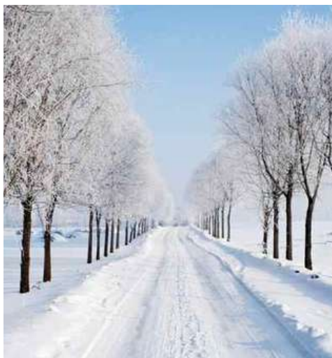
Jilin Province, Jilin WUSONG CORRIDOR 雾凇长廊