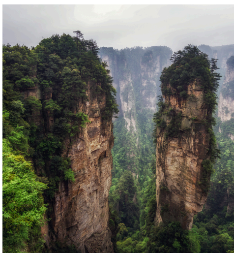
Zhangjiajie, Hunan YUANJIAJIE 袁家界