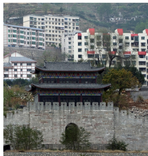
Three Gorges, Hubei FENGDU GHOST CITY 丰都鬼城

For reservations or any other inquiries, please contact our staff.