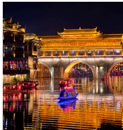
Fenghuang, Hunan FENGHUANG ANCIENT TOWN 凤凰古城