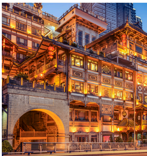
Chongqing, Yuzhong HONGYADONG 洪崖洞