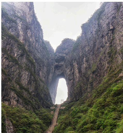
Zhangjiajie, Hunan TIANMEN MOUNTAIN 天门山