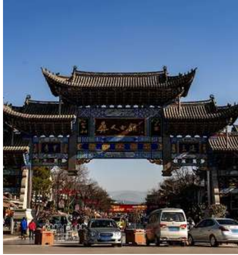
Chuxiong Yi, Yunnan YIREN ANCIENT TOWN 彝人古镇