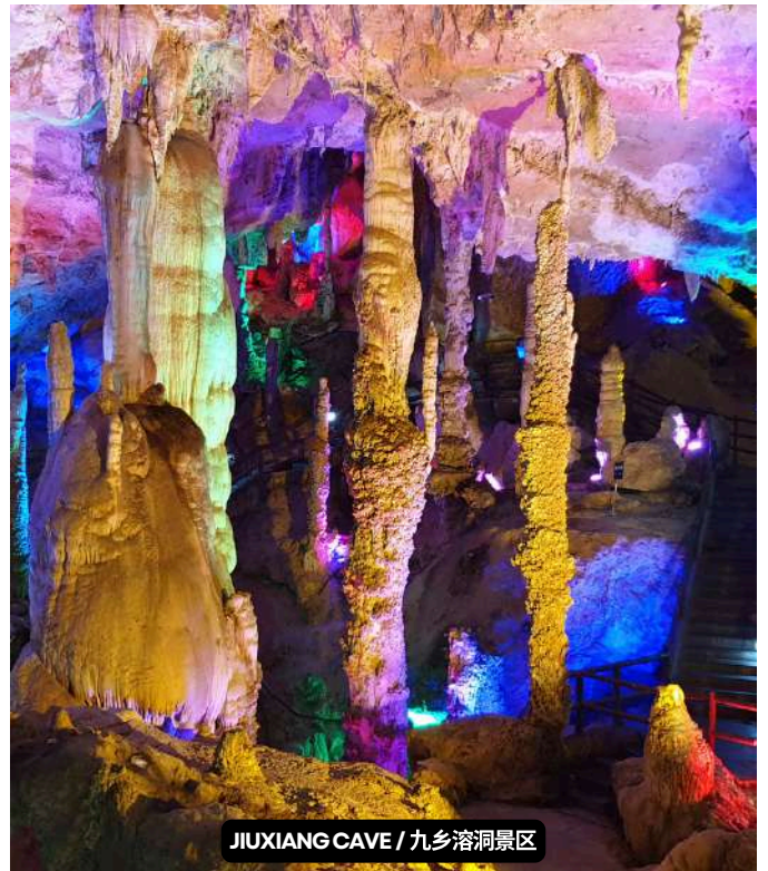
JIUXIANG CAVE / 九乡溶洞景区