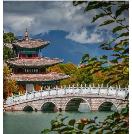
Lijiang, Yunnan BLACK DRAGON POOL 黑龙潭

For reservations or any other inquiries, please contact our staff.