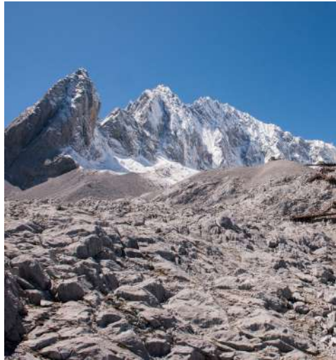
Lijiang, Yunnan DRAGON SNOW MOUNTAIN 玉龙雪山