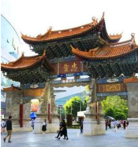
Kunming, Yunnan NANPING PEDESTRIAN STREET 南屏街