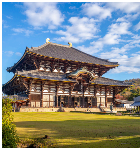
Nara TODAI-JI 东大寺