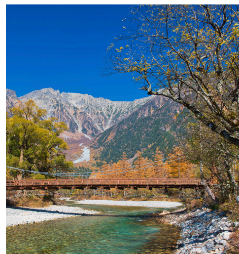
Azumino KAMIKOCHI 上高地景观

For reservations or any other inquiries, please contact our staff.