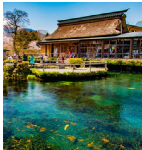
Oshino OSHINO HAKKAI 忍野八海