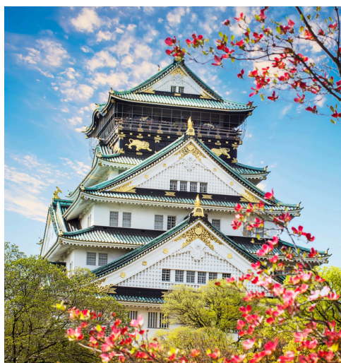
Osaka OSAKA CASTLE 大阪城