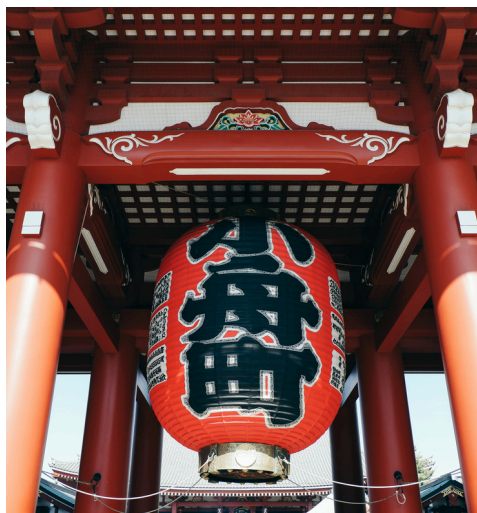
Tokyo ASAKUSA TEMPLE 浅草寺