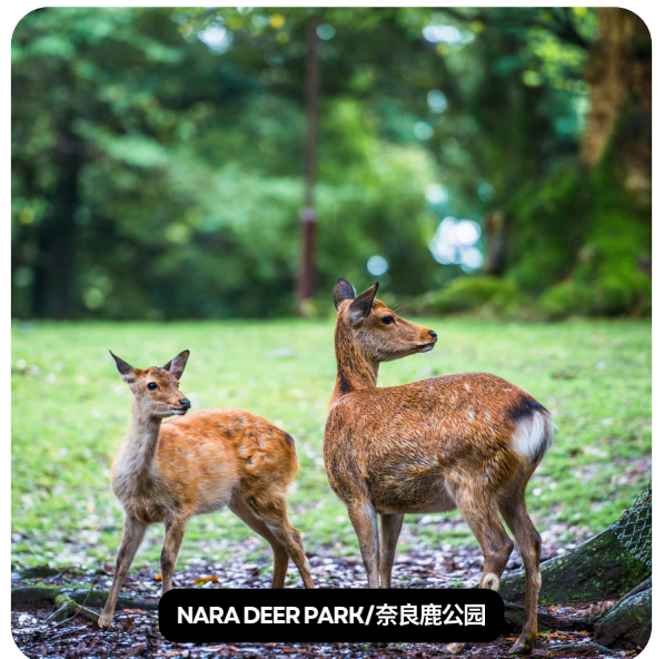
NARA DEER PARK / 奈良鹿公园