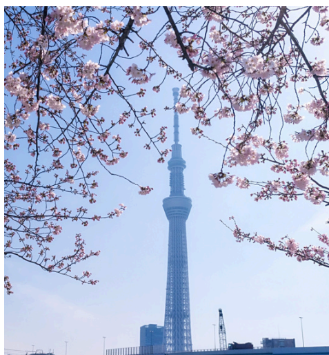
Tokyo TOKYO SKYTREE 东京晴空塔