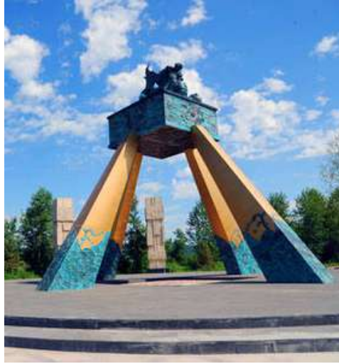
Arctic Village, Mohe GOLDEN ROOSTER CROWN SQUARE 金鸡之冠广场