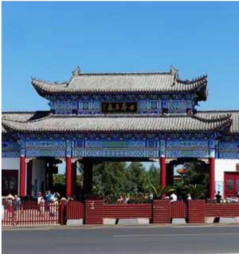
Wudalianchi, Heilongjiang BEIYINQUAN 北饮泉