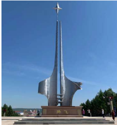
Mohe, Heilongjiang POLARIS PLAZA 北极星广场