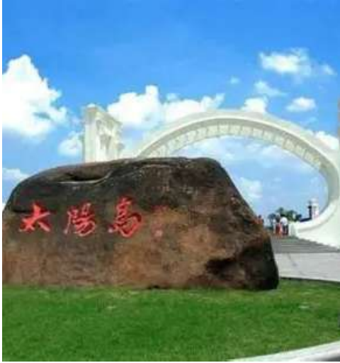
Harbin SUN ISLAND PARK 太阳岛公园