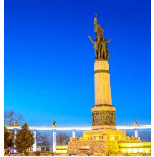
Heilongjiang, Harbin FLOOD CONTROL MONUMENT 防洪纪念塔