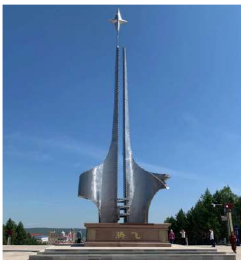
Mohe, Heilongjiang POLARIS PLAZA 北极星广场