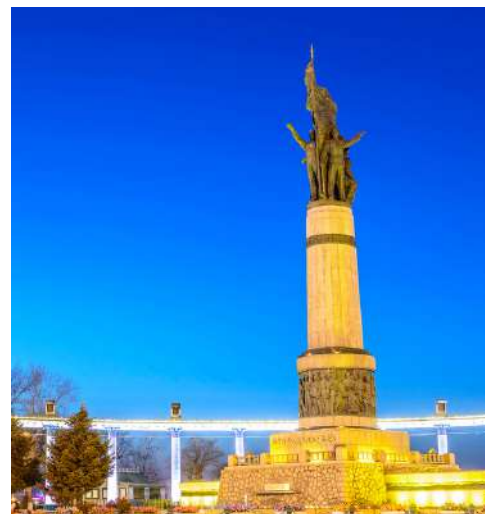
Heilongjiang, Harbin FLOOD CONTROL MONUMENT 防洪纪念塔