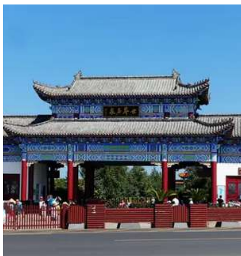
Wudalianchi, Heilongjiang BEIYINQUAN 北饮泉