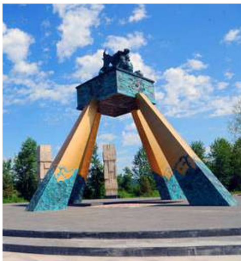
Arctic Village, Mohe GOLDEN ROOSTER CROWN SQUARE 金鸡之冠广场