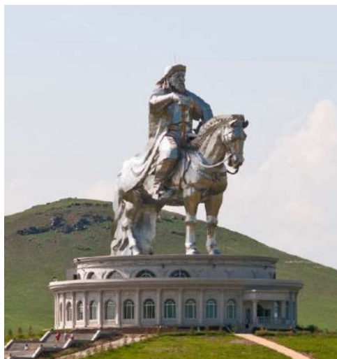
Hailar, Mohe GENGHIS KHAN SQUARE 成吉思汗广场