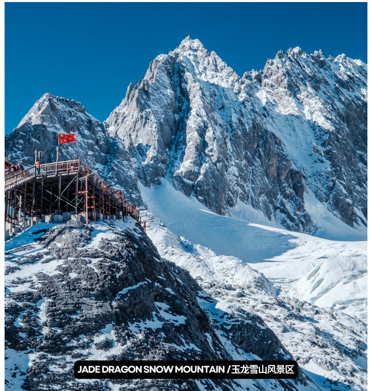
JADE DRAGON SNOW MOUNTAIN / 玉龙雪山风景区