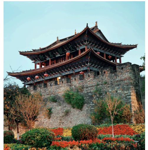
Dali, Yunnan DALI ANCIENT CITY 大理古城

For reservations or any other inquiries, please contact our staff.