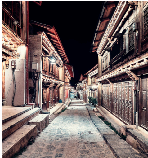
Shangrila, Yunnan DUKEZONG GUZHEN 独克宗古城