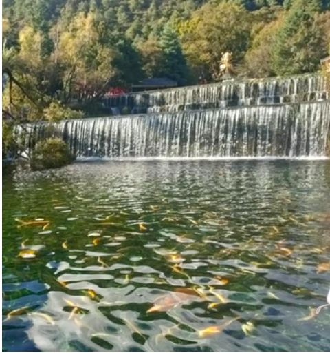
Lijiang, Yunnan JADE WATER VILLAGE 玉水寨