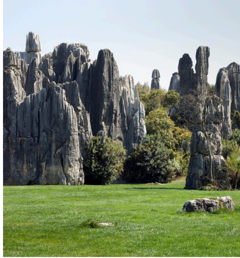
Kunming, Yunnan STONE FOREST 石林