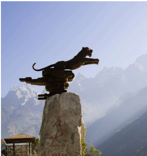
Shangrila, Yunnan TIGER LEAPING GORGE 虎跳峡