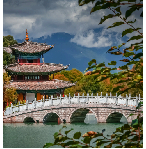
Lijiang, Yunnan BLACK DRAGON POOL 黑龙潭