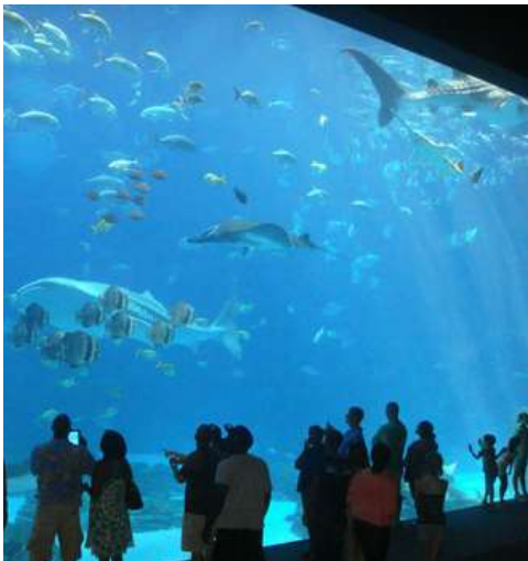
Noboribetsu NOBORIBETSU AQUARIUM 登别水族馆