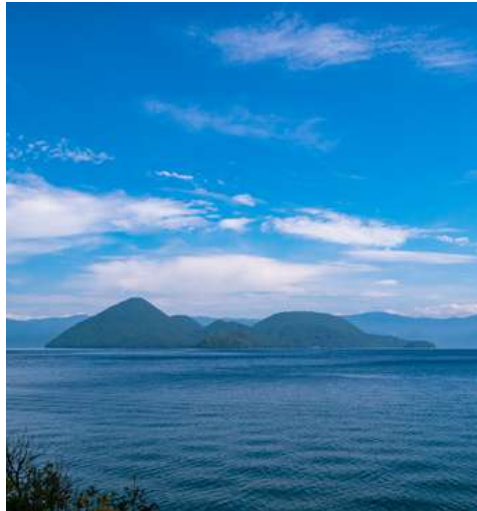
Lake Toya TOYA NATIONAL PARK 洞爷湖