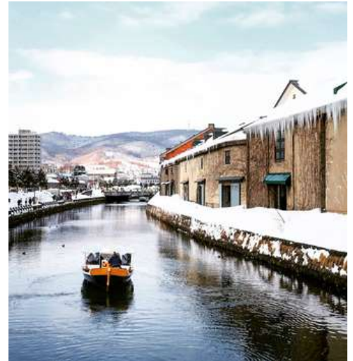
Otaru OTARU CANAL 小樽运河