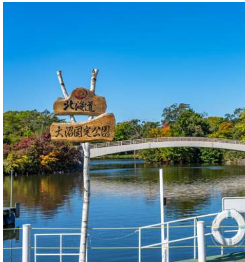
Kumamoto ONUMA NATIONAL PARK 大沼国定公园