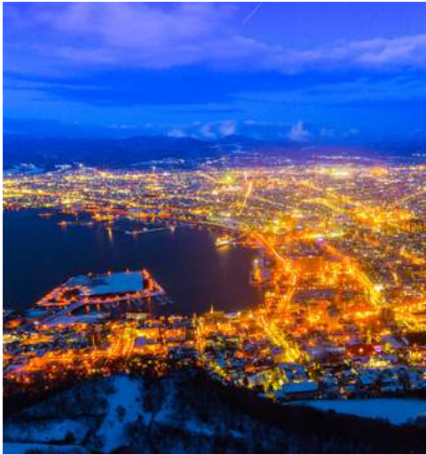
Hakodate MT. HAKODATE 函馆山