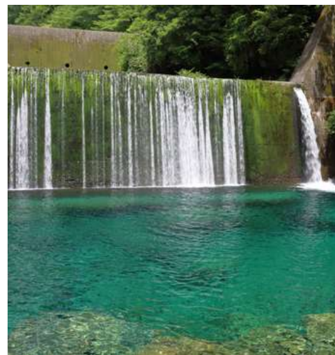
Kochi NIYODO RIVER 仁淀川