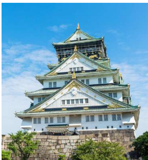
Osaka OSAKA CASTLE 大阪城