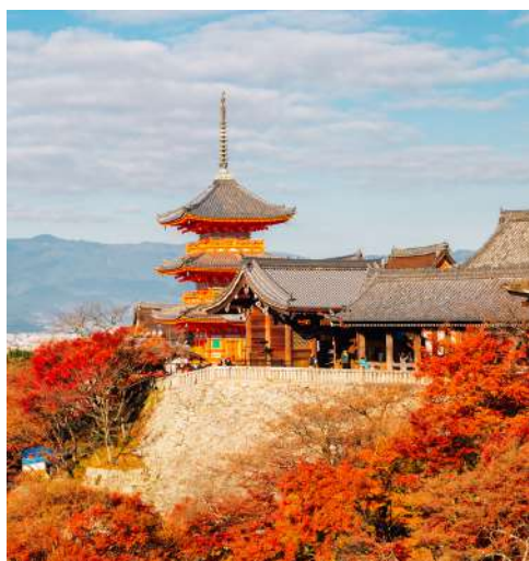
Kyoto KIYOMIZUDERA TEMPLE 清水寺