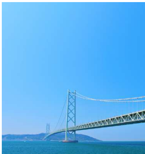
Tokushima AKASHI KAIKYO BRIDGE 明石海峡大桥