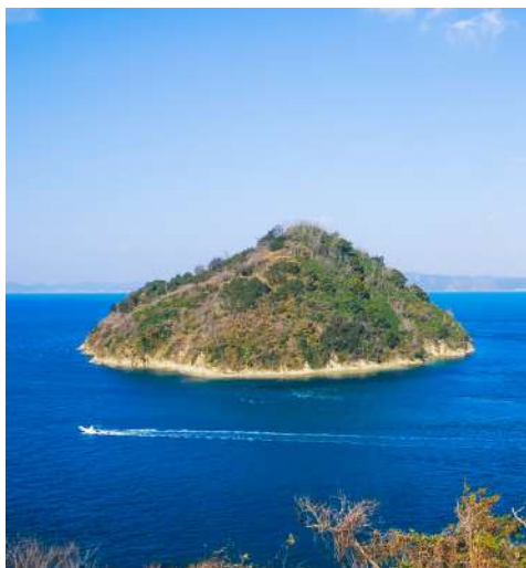
Takamatsu GOSHIKIDAI 五色台