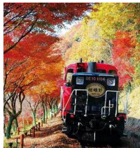
Kyoto SAGANO SCENIC RAILWAY RIDE 上高地景观

For reservations or any other inquiries, please contact our staff.