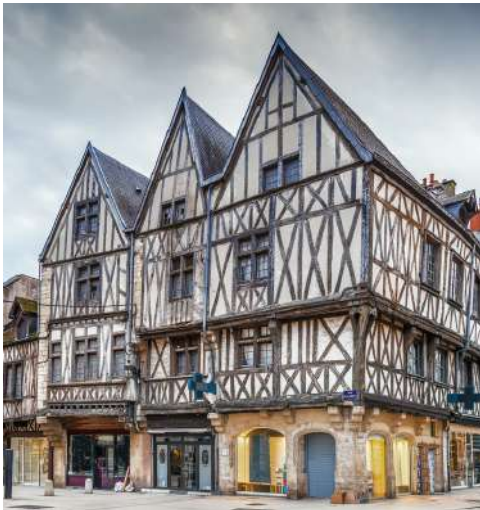
Dijon, France DIJON OLD TOWN 第戎老城