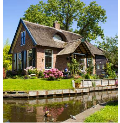
Giethoorn, Netherlands GIETHOORN 羊角村