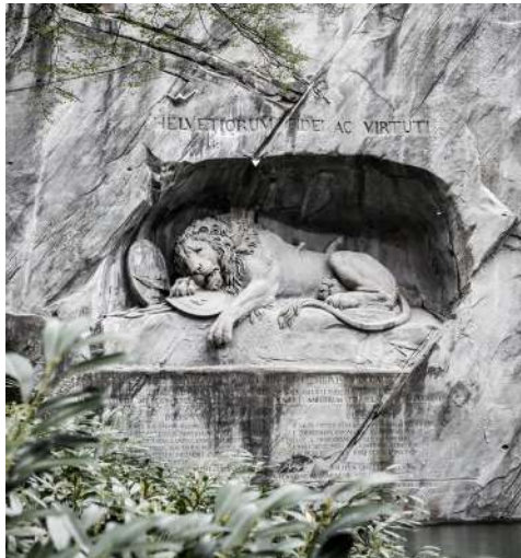
Lucerne, Switzerland LION MONUMENT 狮子纪念碑