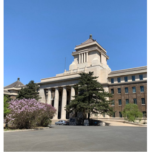
Jilin, Changchun EIGHT DEPARTMENTS OF MANCHUKUO 伪满八大部