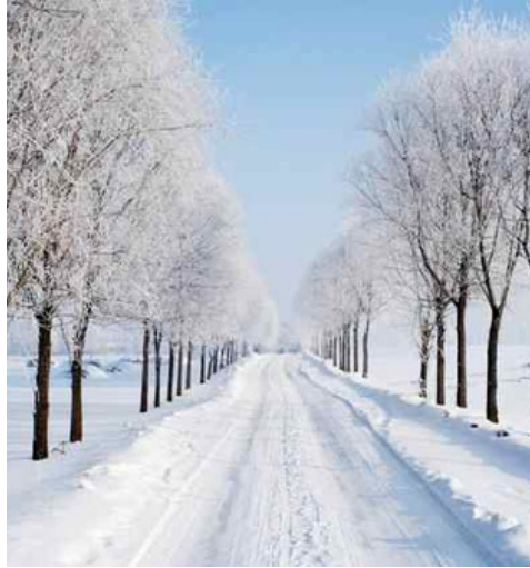
Jilin Province, Jilin WUSONG CORRIDOR 雾凇长廊