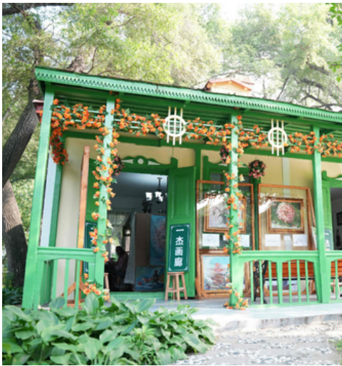
Heilongjiang, Harbin RUSSIAN TOWN 俄罗斯小镇