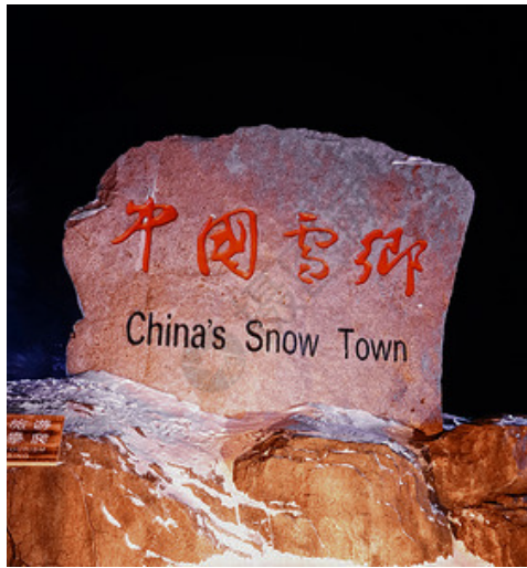
Heilongjiang, Harbin LARGE STONE MONUMENT 大石碑