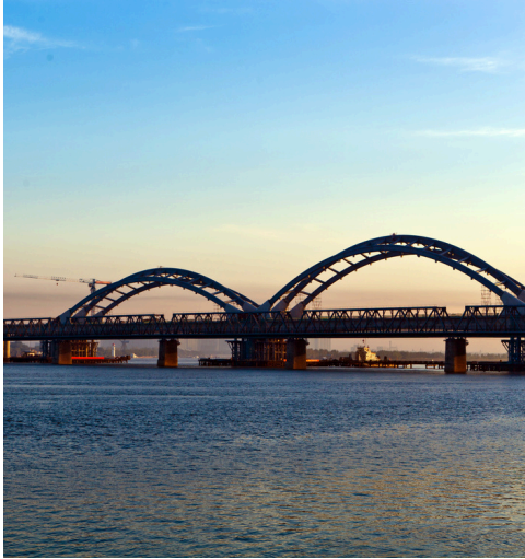
Jilin, Harbin SONGHUA RIVER 松花江