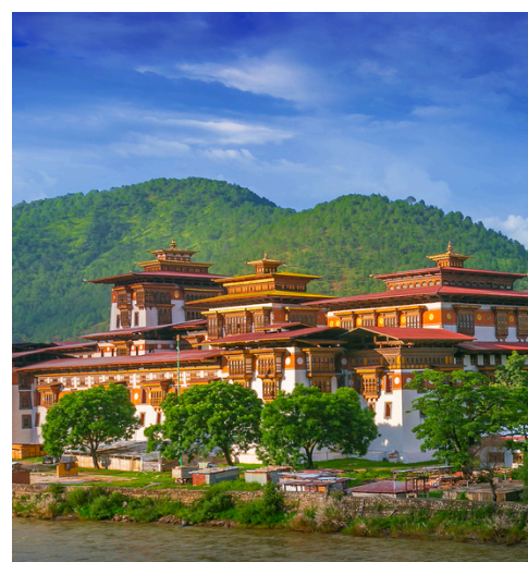
Punakha PUNAKHA DZONG 普那卡宗堡

For reservations or any other inquiries, please contact our staff.