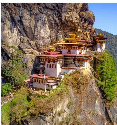
Paro TIGER NEST 虎穴寺