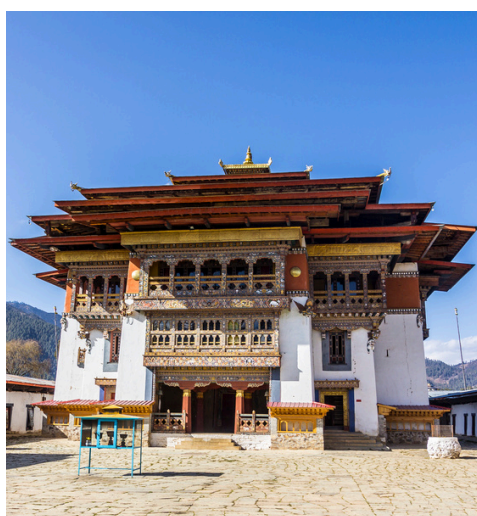
Punakha GANGTEY GONPA GANGTEY MONASTERY 岗蒂寺