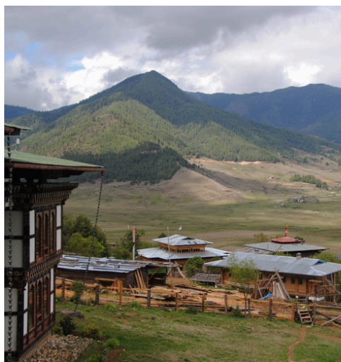
Wangdue PHOBJIKA VALLEY 普布吉卡山谷