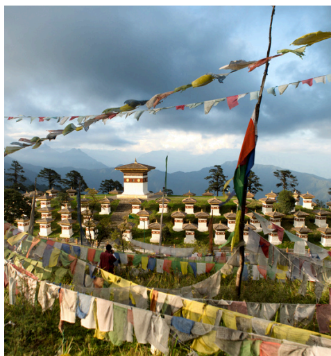
Punakha DOCHULA PASS 多楚拉山口