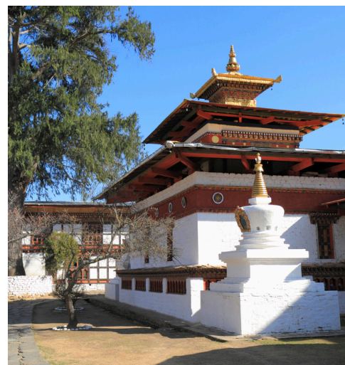
Thimphu KYICHU TEMPLE 祈楚寺