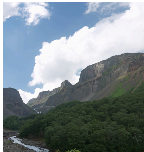
Heilongjiang, Harbin MT. CHANGBAI 长白山