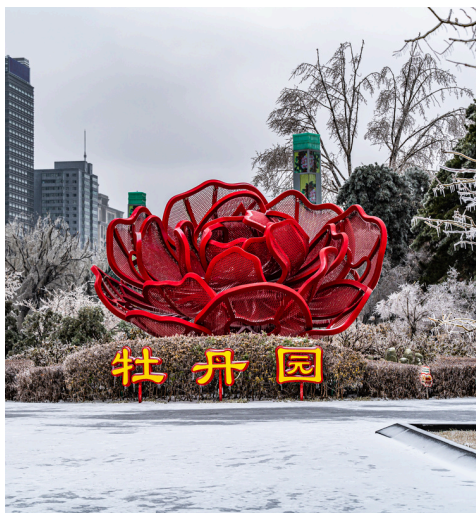
Jilin, Changchun MU DAN YUAN 牡丹园