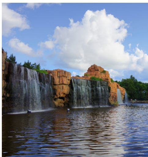
Heilongjiang, Harbin TAI YANG DAO 太阳岛