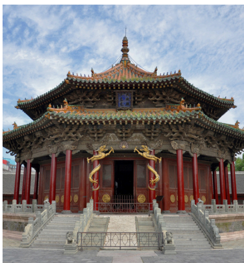
Shenyang, Liaoning IMPERIAL PALACE 沈阳故宫