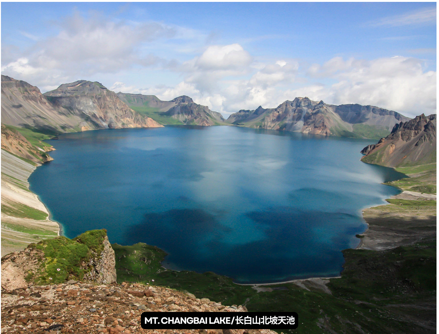
MT. CHANGBAI LAKE/长白山北坡天池

Disclaimer: Due to travel restrictions related to the COVID-19 pandemic, local religious holidays, public holidays, weather conditions, transportation, natural disasters, or other unforeseen circumstances, SEARCH TRAVEL reserves the right to make necessary adjustments to the itinerary (including changes in the order of sightseeing) to ensure the smooth progress of the trip, with or without prior notice. Please note that if the travel itinerary is affected by the aforementioned issues, refunds or replacements will not be provided. Images are for reference only. In case of any discrepancies between the Chinese and English versions of the itinerary, the Chinese version shall prevail.