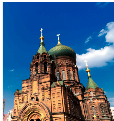
Heilongjiang, Harbin SOPHIA CHURCH SQUARE 圣索菲亚教堂广场

For reservations or any other inquiries, please contact our staff.