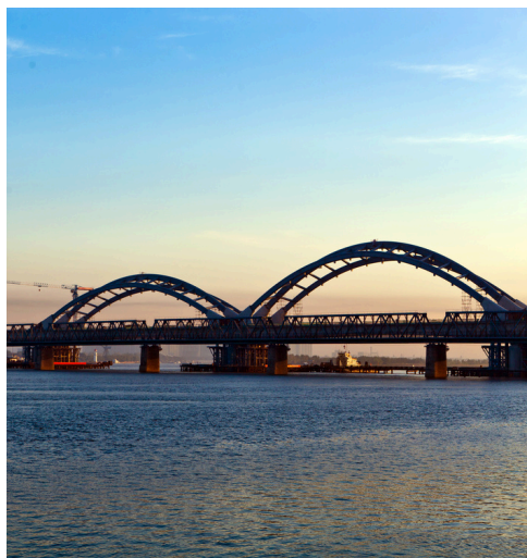
Jilin, Harbin SONGHUA RIVER 松花江