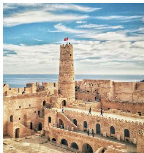
Monastir, Tunisia MONASTIR'S RIBAT 蒙斯特尔的里巴特

For reservations or any other inquiries, please contact our staff.