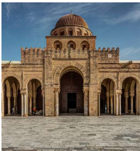
Kairouan, Tunisia KAIROUAN 凯鲁万