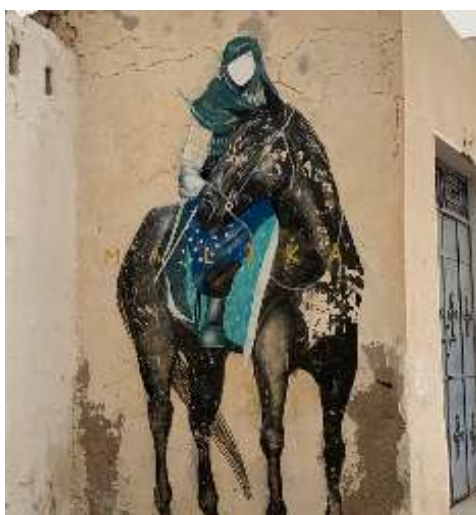
Djerba, Tunisia DJERBAHOOD 杰尔巴街头艺术