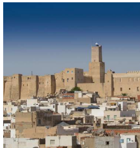
Sousse, Tunisia SOUSSE MEDINA 苏塞麦地那