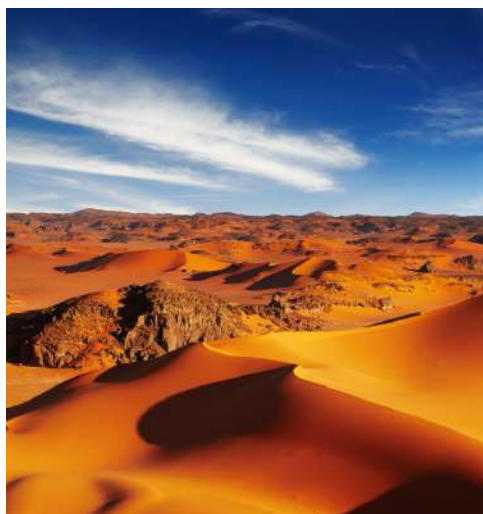
Tunisia SAHARA DESSERT 撒哈拉沙漠