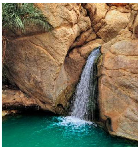
Tunisia CHEBIKA OASIS 马赛马拉国家公园