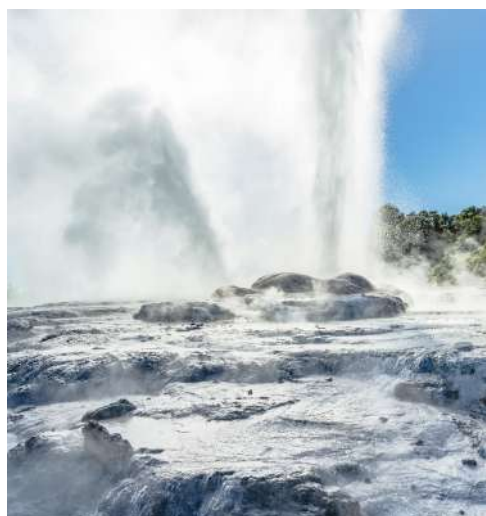
TE PUIA THERMAL RESERVE 普伊亚地热保护区