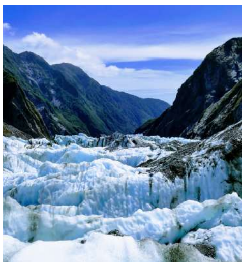
FRANZ JOSEF GLACIER 弗朗茨·约瑟夫冰川