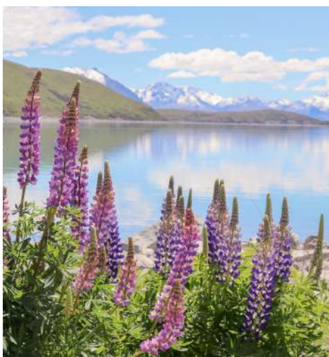
LAKE TEKAPO 特卡波湖