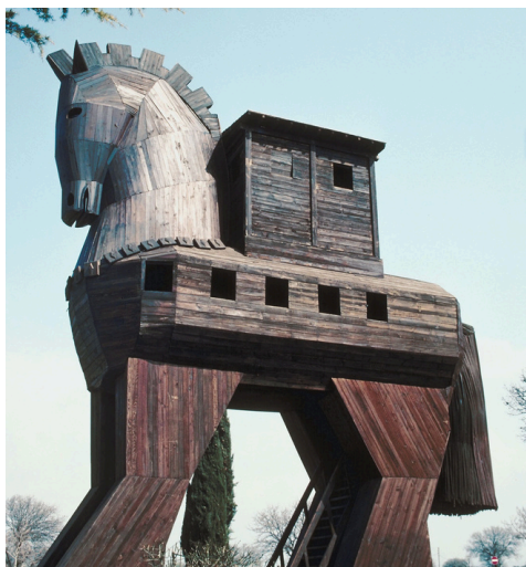
Canakkale, Turkey TROJAN HORSE 特洛伊木马