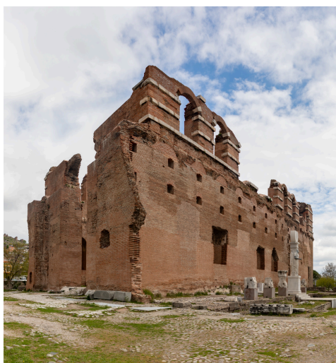
Bergama, Turkey THE RED BASILICA 红教堂 (塞拉匹斯神庙)