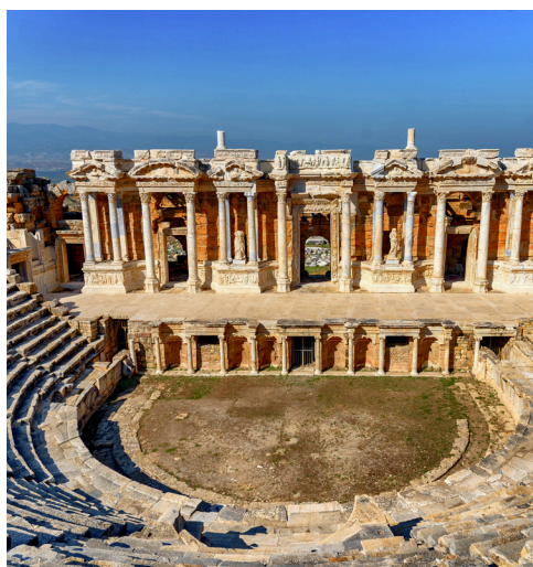
Pamukkale, Turkey HIERAPOLIS 希拉波利斯