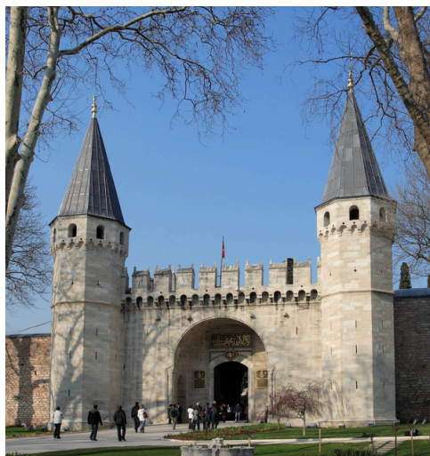
Istanbul, Turkey TOPKAPI PALACE 托普卡帕宫