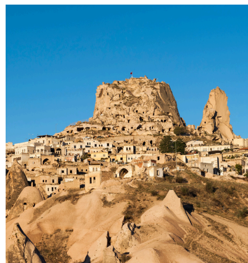
Cappadocia, Turkey UCHISAR CASTLE 乌奇萨尔城堡

For reservations or any other inquiries, please contact our staff.