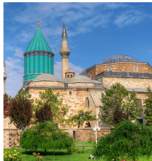
Konya, Turkey MEVLANA MUSEUM 梅乌拉那博物馆