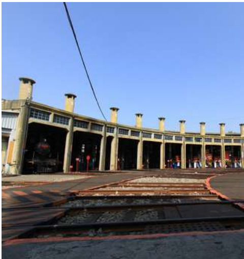
Changhua CHANGHUA ROUNDHOUSE 彰化扇形车库