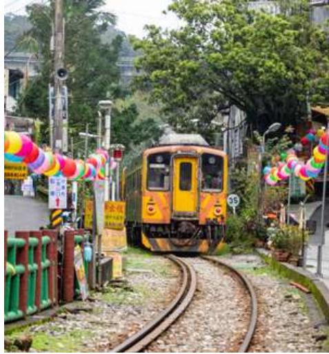
Taipei SHIFEN OLD STREET 十分老街