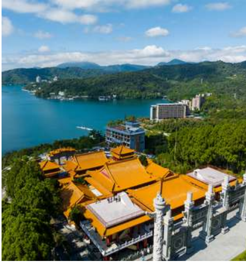
Nantou SUN MOON LAKE 日月潭