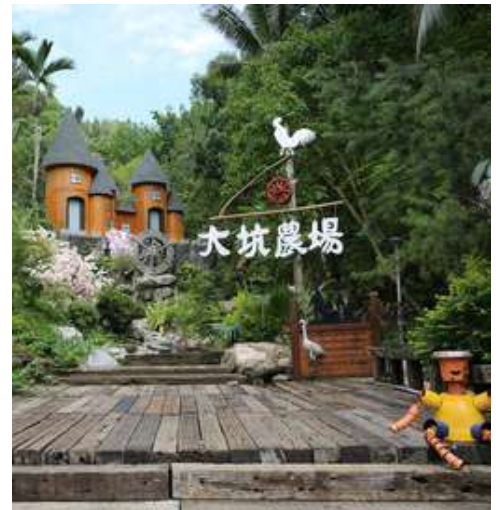
Tainan DAKENG LEISURE FARM 大坑休闲农场

For reservations or any other inquiries, please contact our staff.