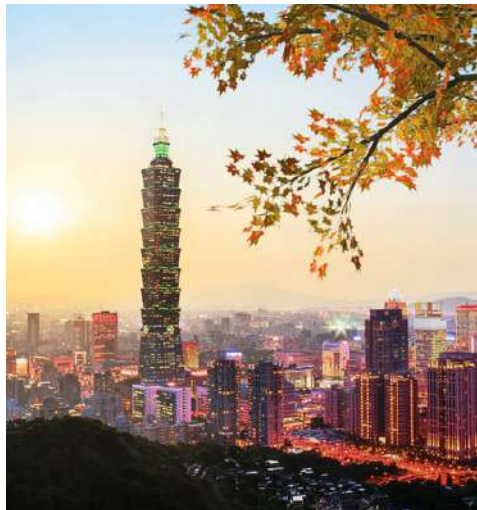
Taipei TAIPEI 101 台北 101