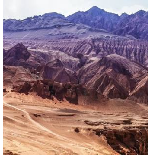
Turpan, Xinjiang FLAMING MOUNTAINS 火焰山