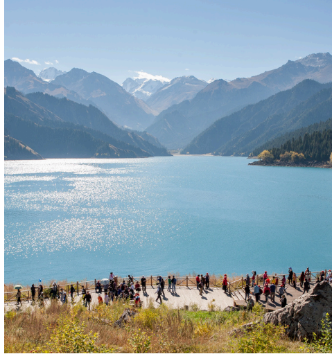
Urumqi, Xinjiang TIANSHAN TIANCHI 天山天池风景区