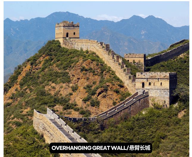
OVERHANGING GREAT WALL / 悬臂长城

• SGD 80 Per Person 中国导游和司机 全程小费 80 新币 每人