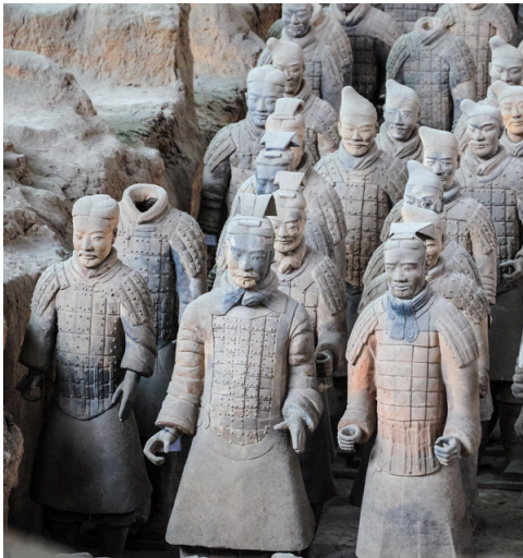
Xi An, Shaanxi TERRACOTTA WARRIORS 兵马俑