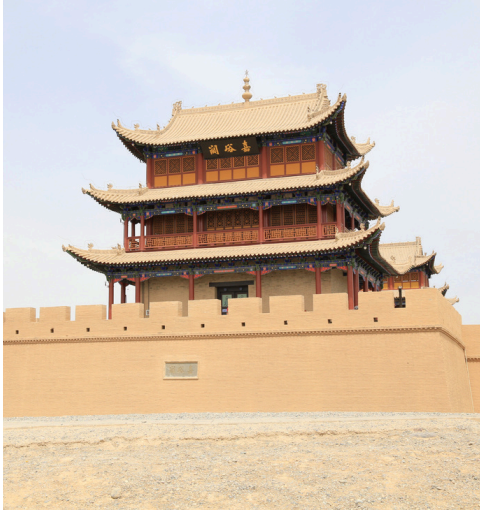
Jiayuguan, Gansu JIAYUGUAN FORTRESS 嘉峪关城楼景区