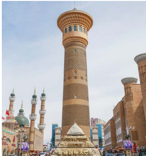
Urumqi, Xinjiang INTERNATIONAL GRAND BAZAAR 国际大巴扎