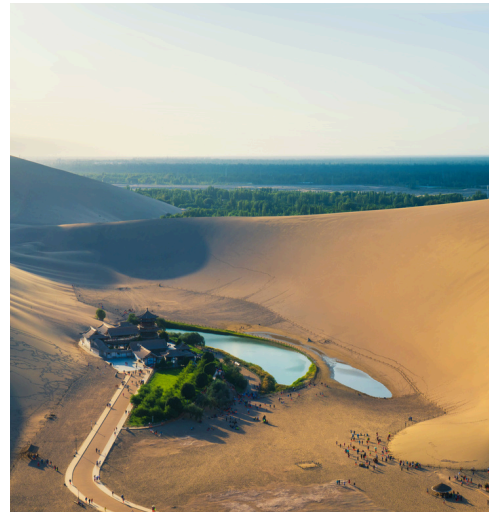
Jiuquan, Gansu MT. MINGSHAN CRESENT LAKE 鸣沙山月牙泉

For reservations or any other inquiries, please contact our staff.