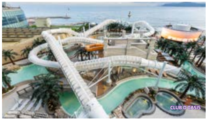
CLUB D OASIS