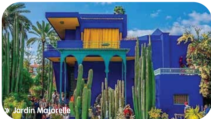
» Jardin Maiorelle