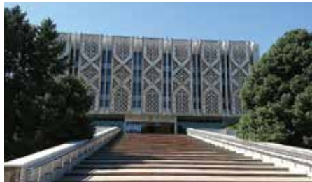
📍 Khiva Ancient City Tour