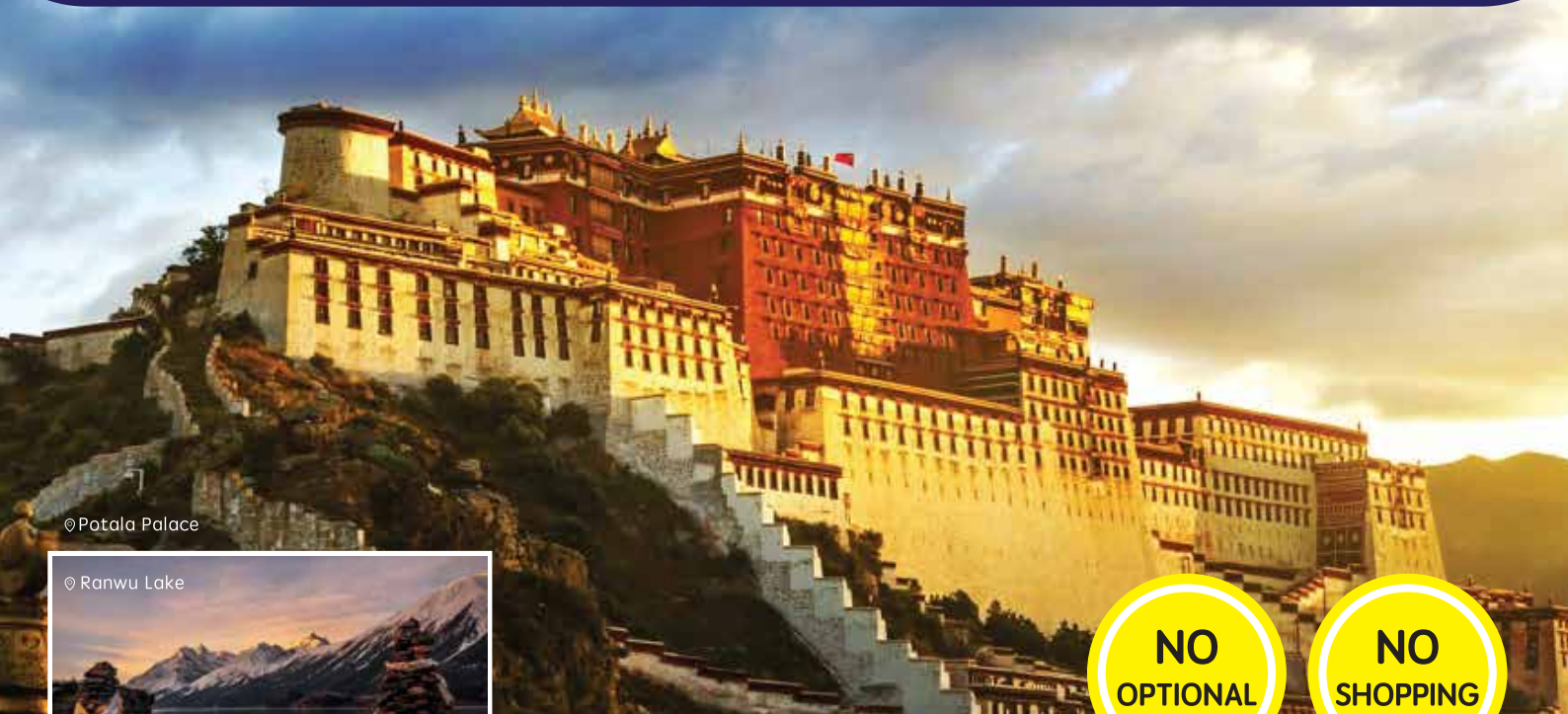
☉ Potala Palace