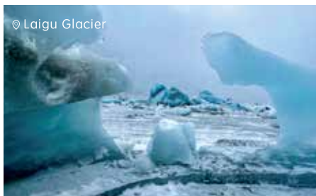
☉ Laigu Glacier