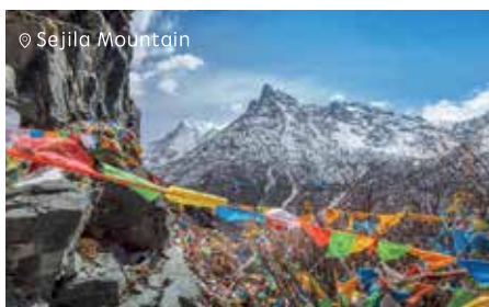
☉ Sejila Mountain