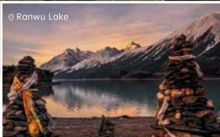
☉ Ranwu Lake