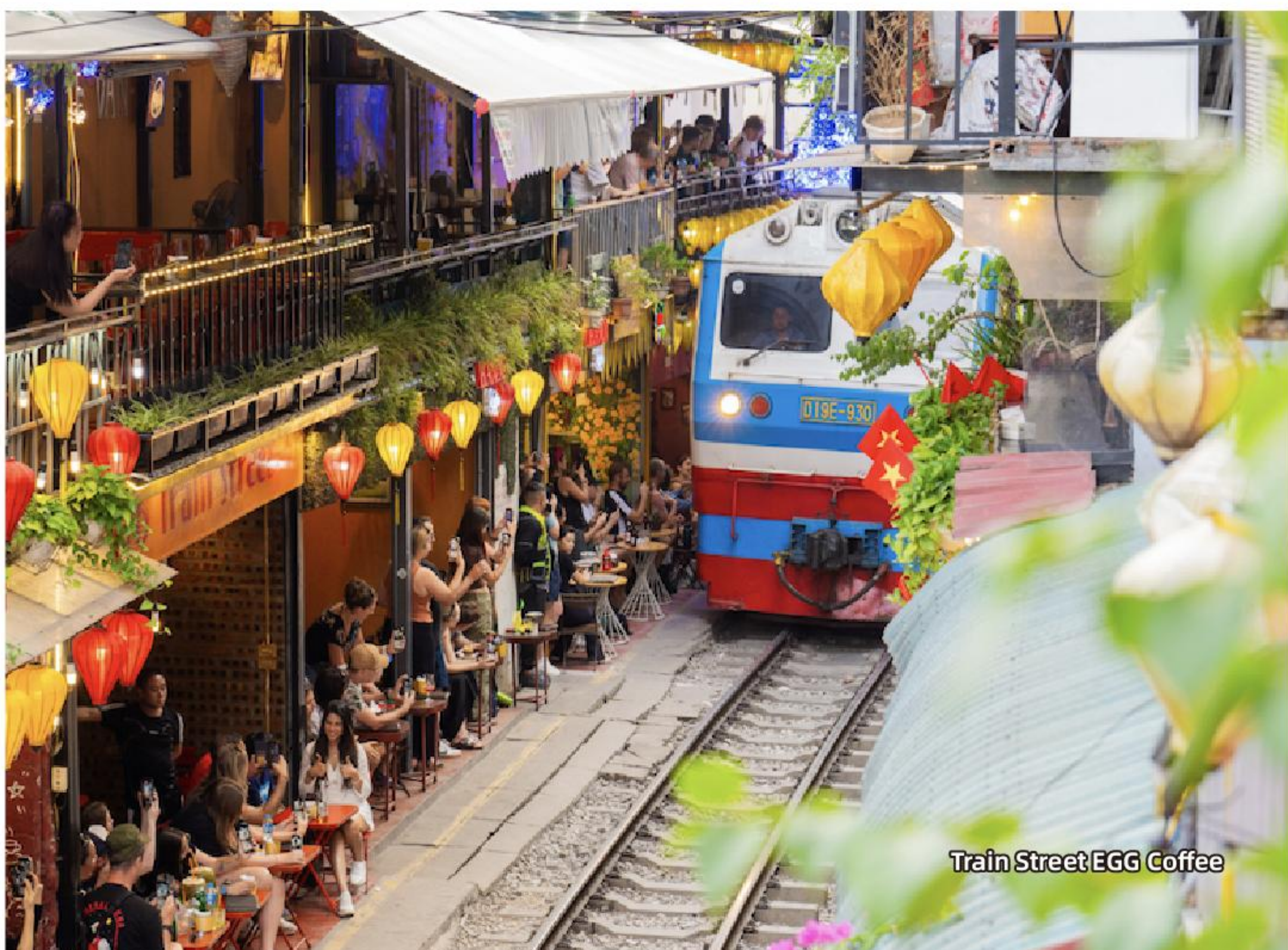
Train Street EGG Coffee