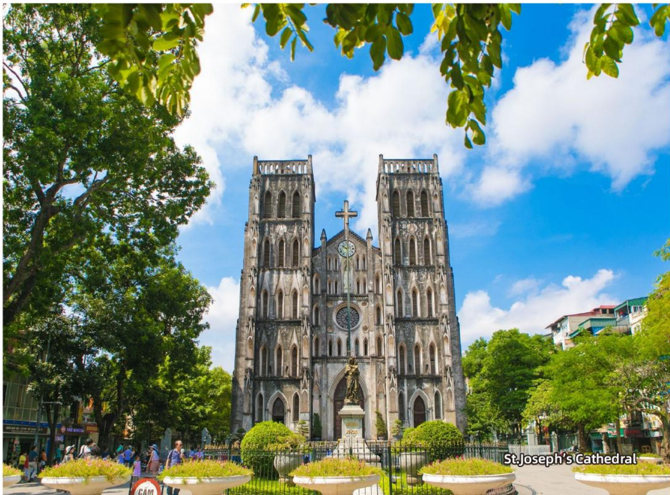
St. Joseph's Cathedral

Hotel: Chau long Sapa2 or Charm Sapa or Similar class 4★