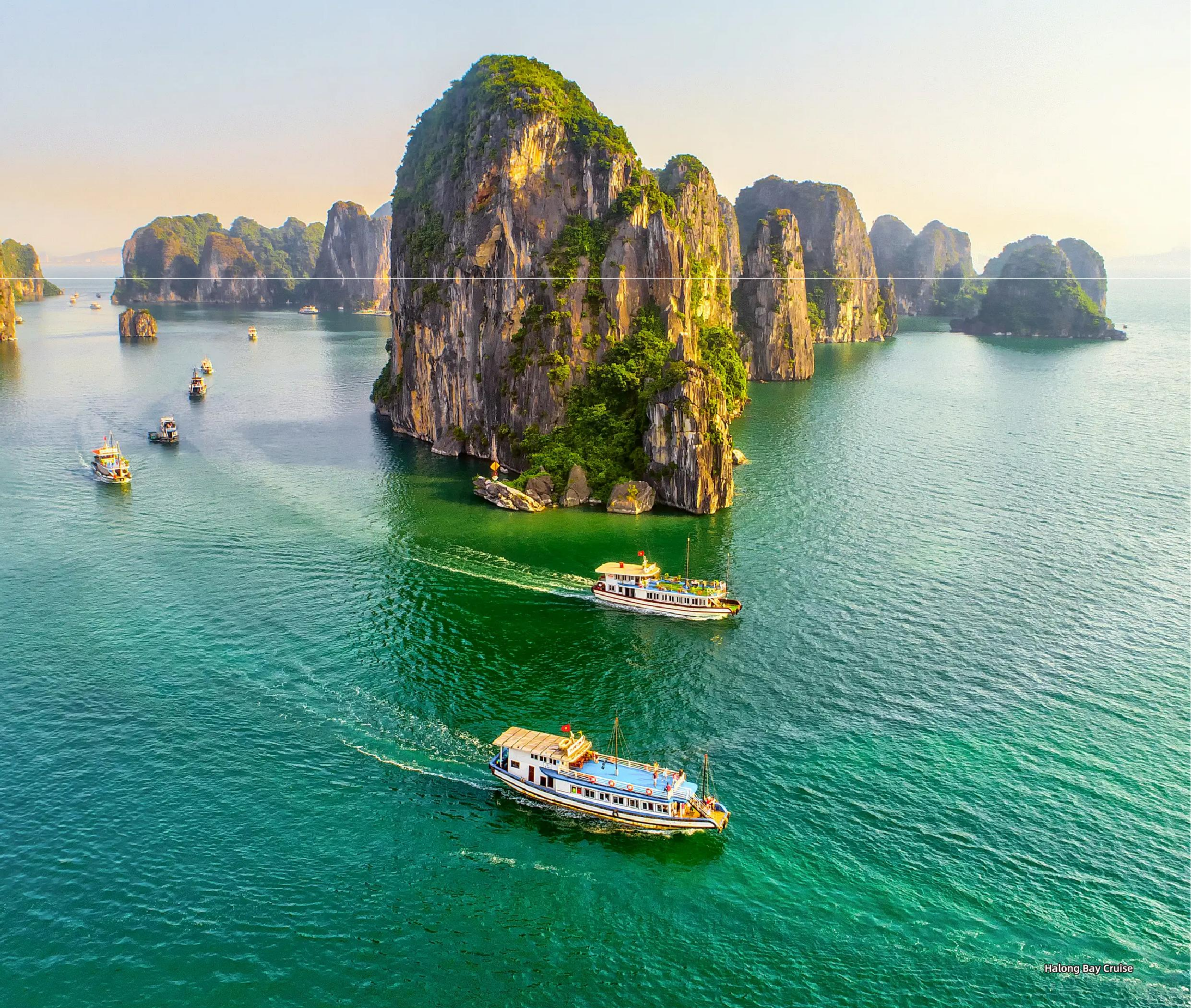
Halong Bay Cruise