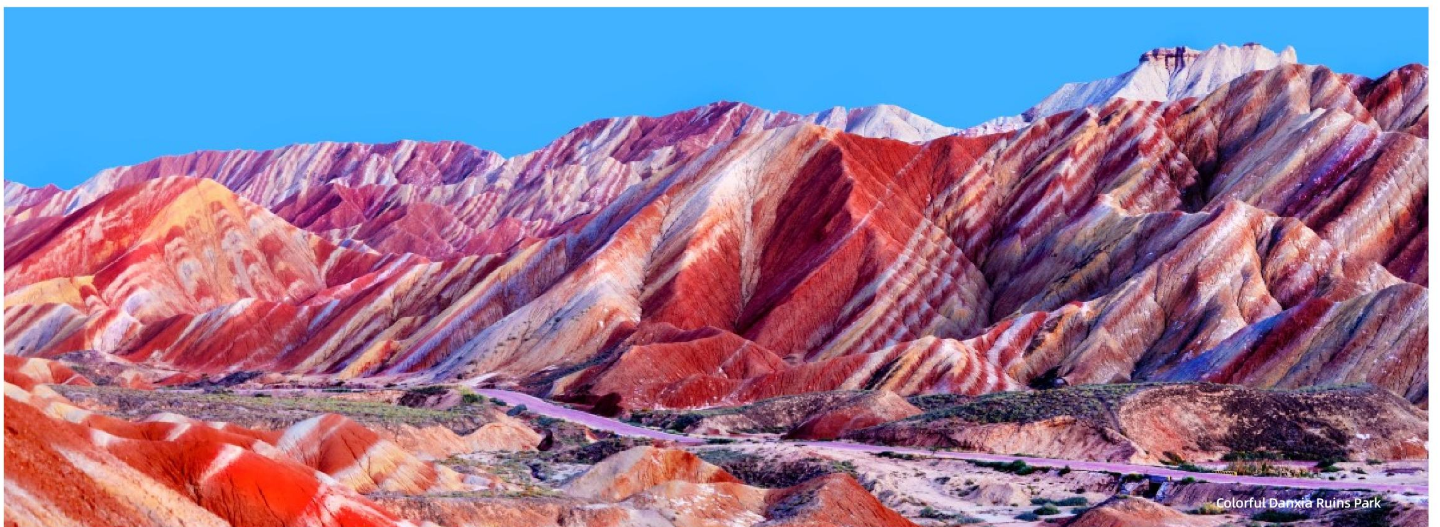
Colorful Danxia Ruins Park

Hotel: Dunhuang Tianhe Hotel 5★ or equivalent