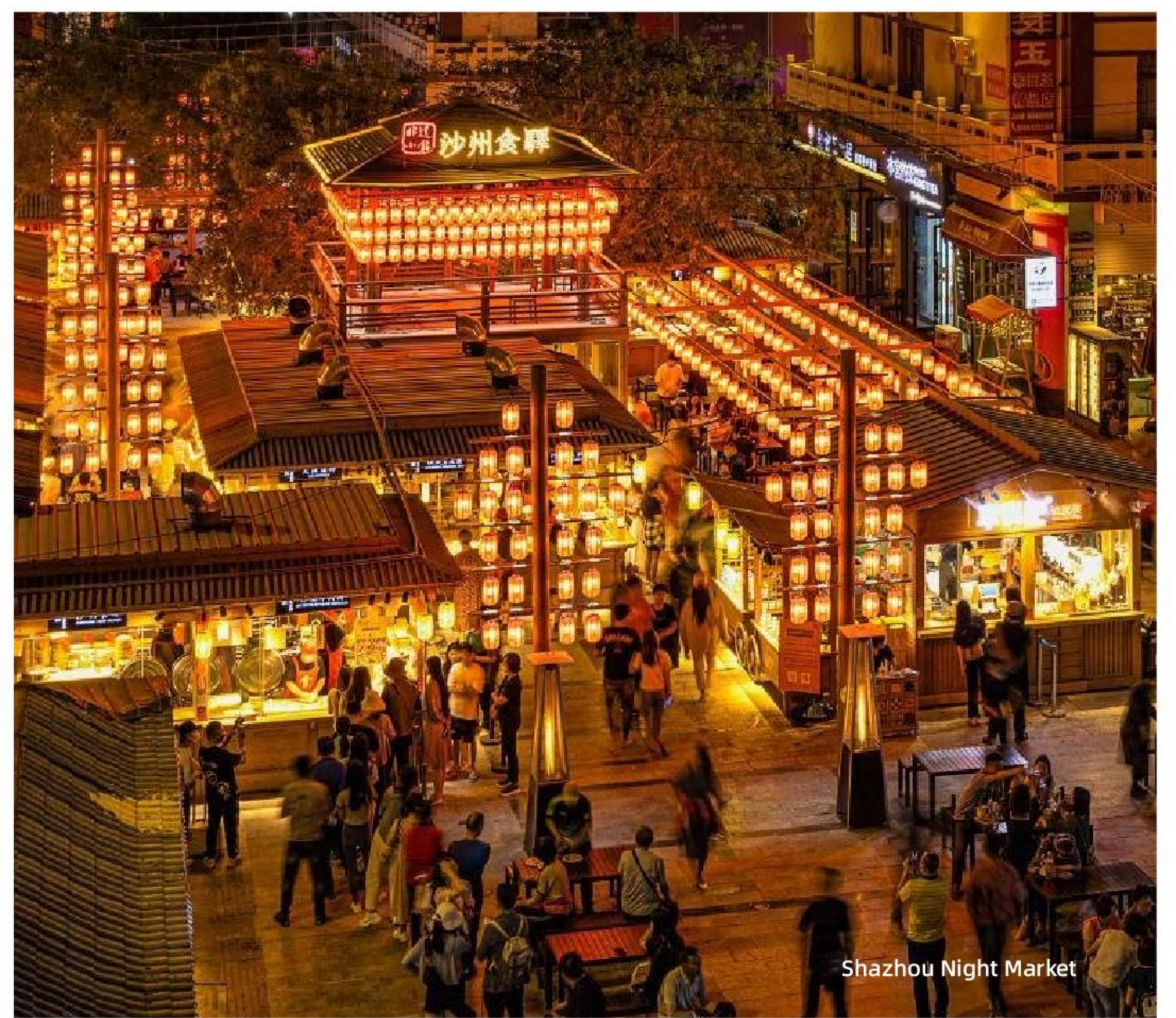
Shazhou Night Market

Hotel: Turpan Hilton Hampton Hotel 5★ or equivalent