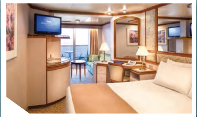
Mini Suite 迷你套房