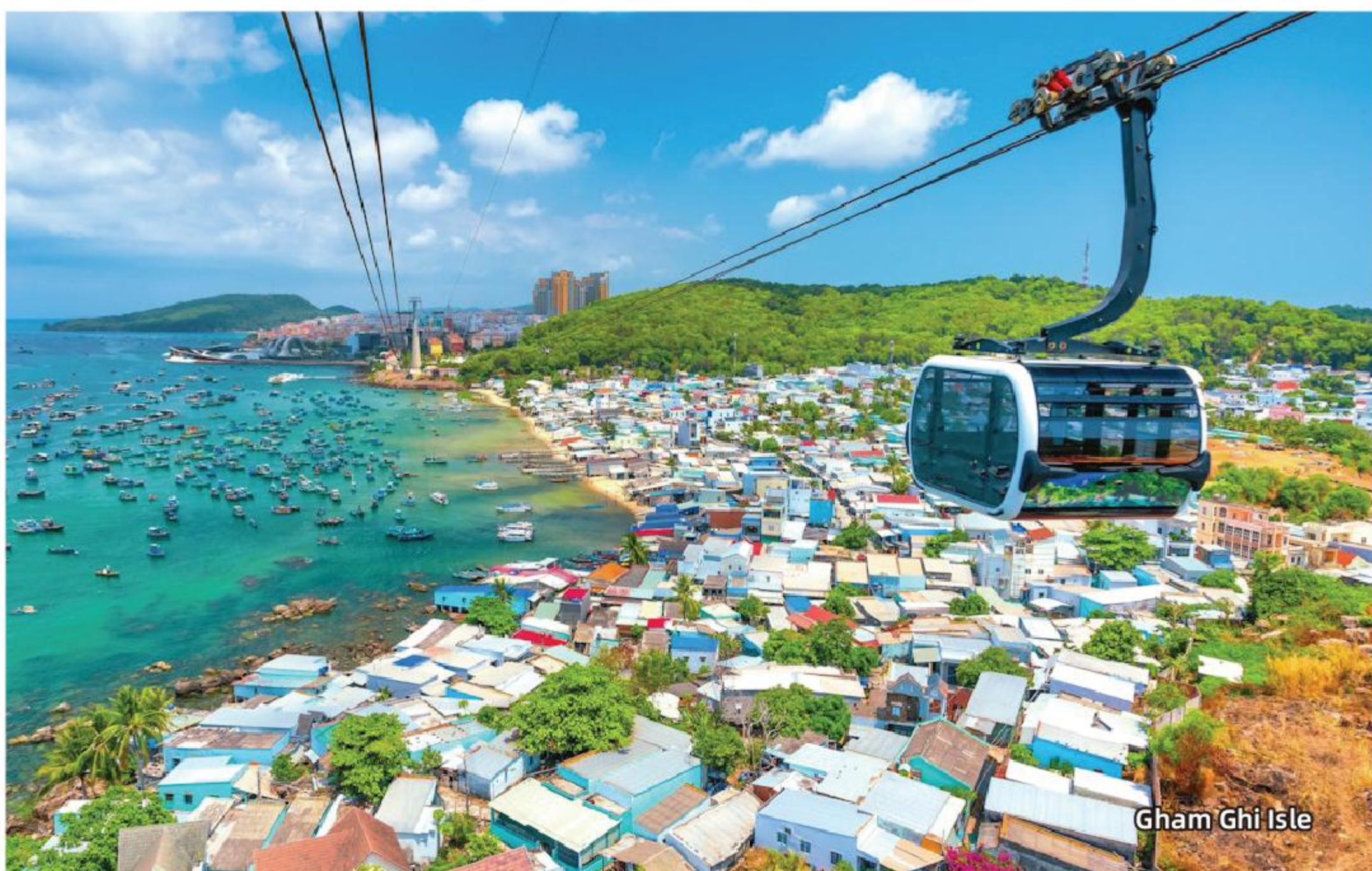
Gham Ghi Isle