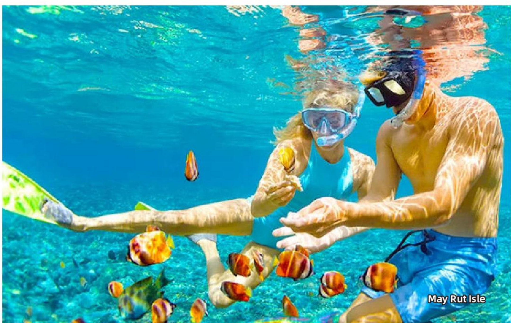
May Rut Isle