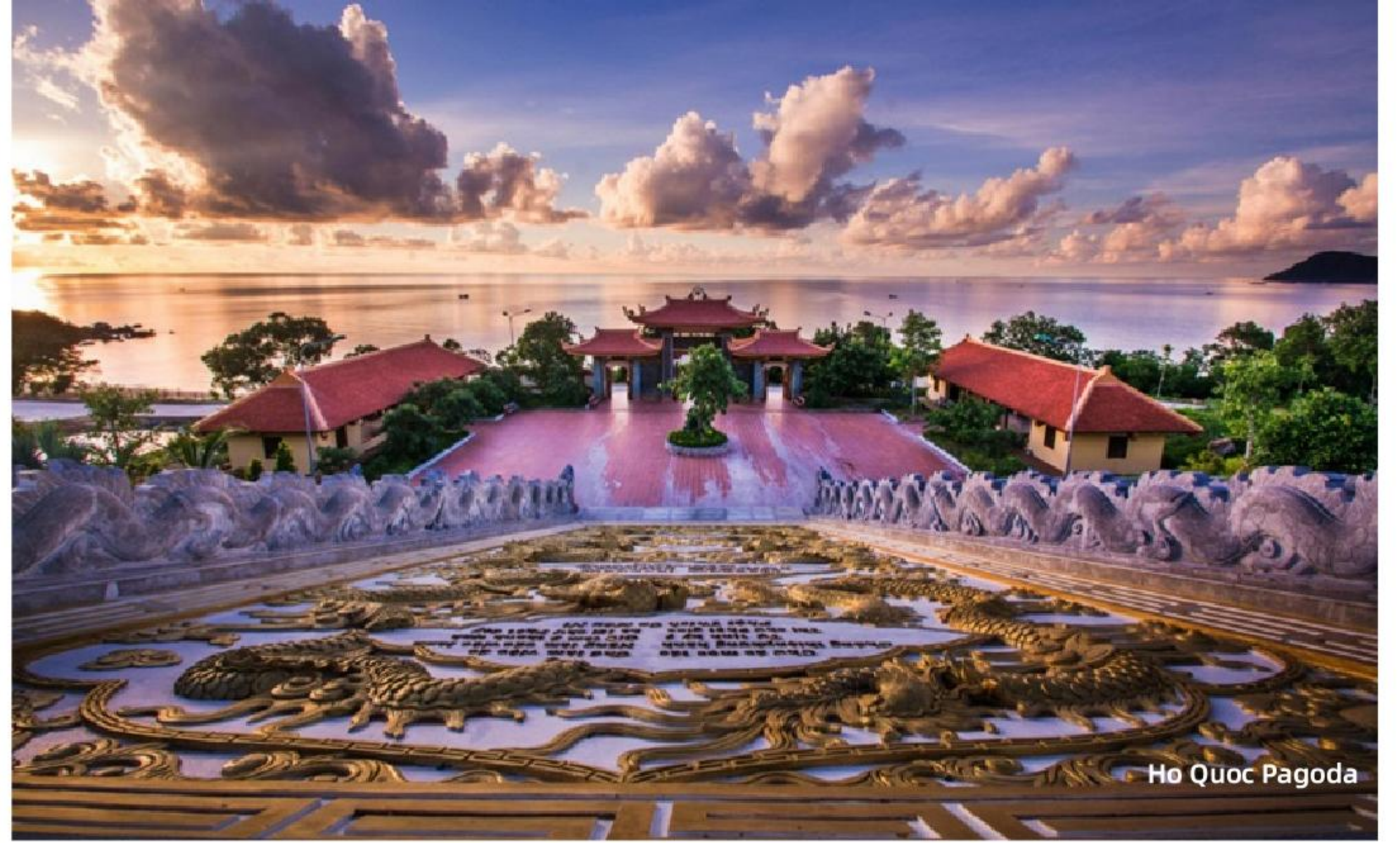
Ho Quoc Pagoda