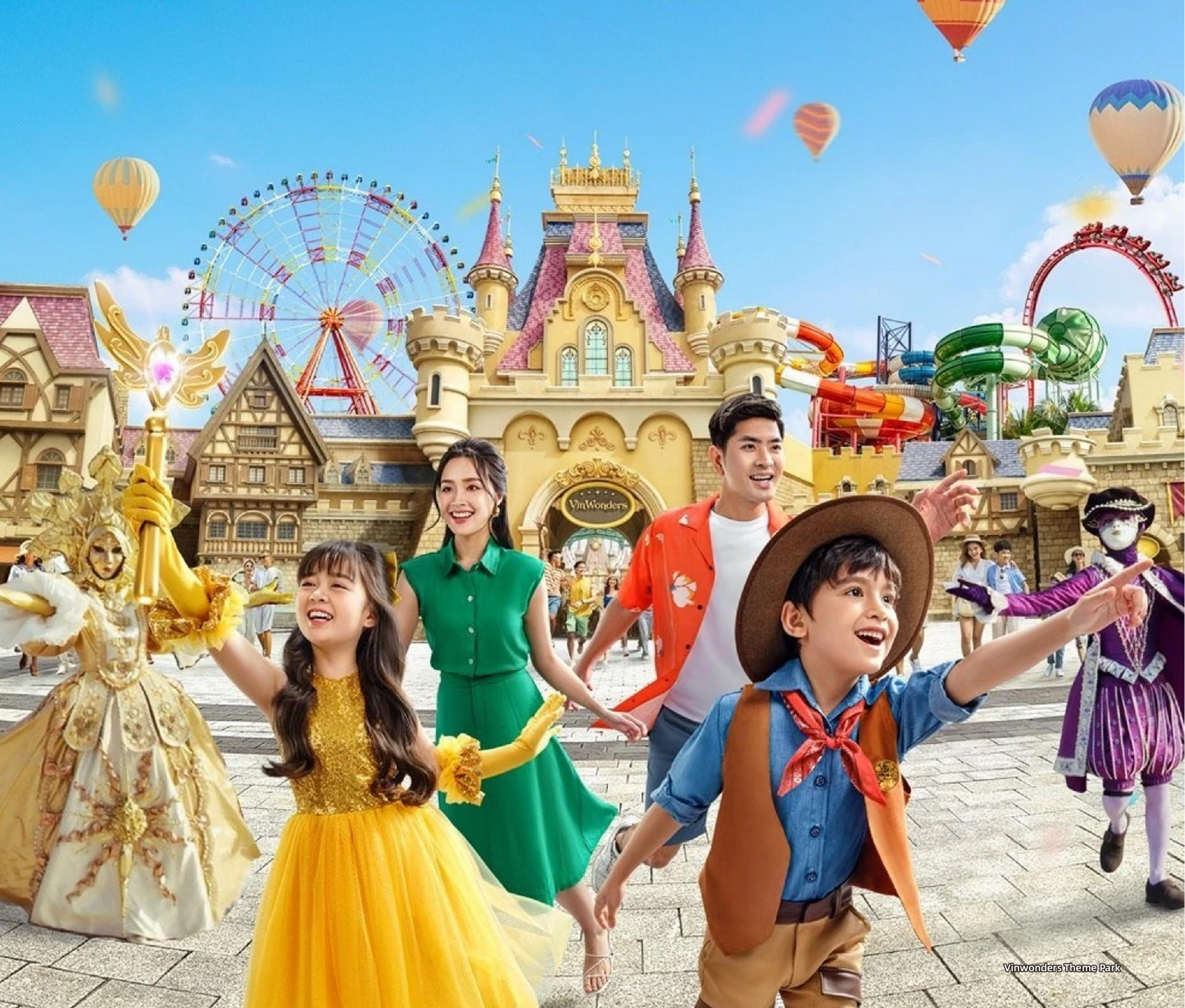
Vinwonders Theme Park