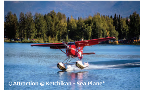
© Attraction @ Ketchikan - Sea Plane*