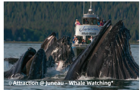
© Attraction @ Juneau - Whale Watching*