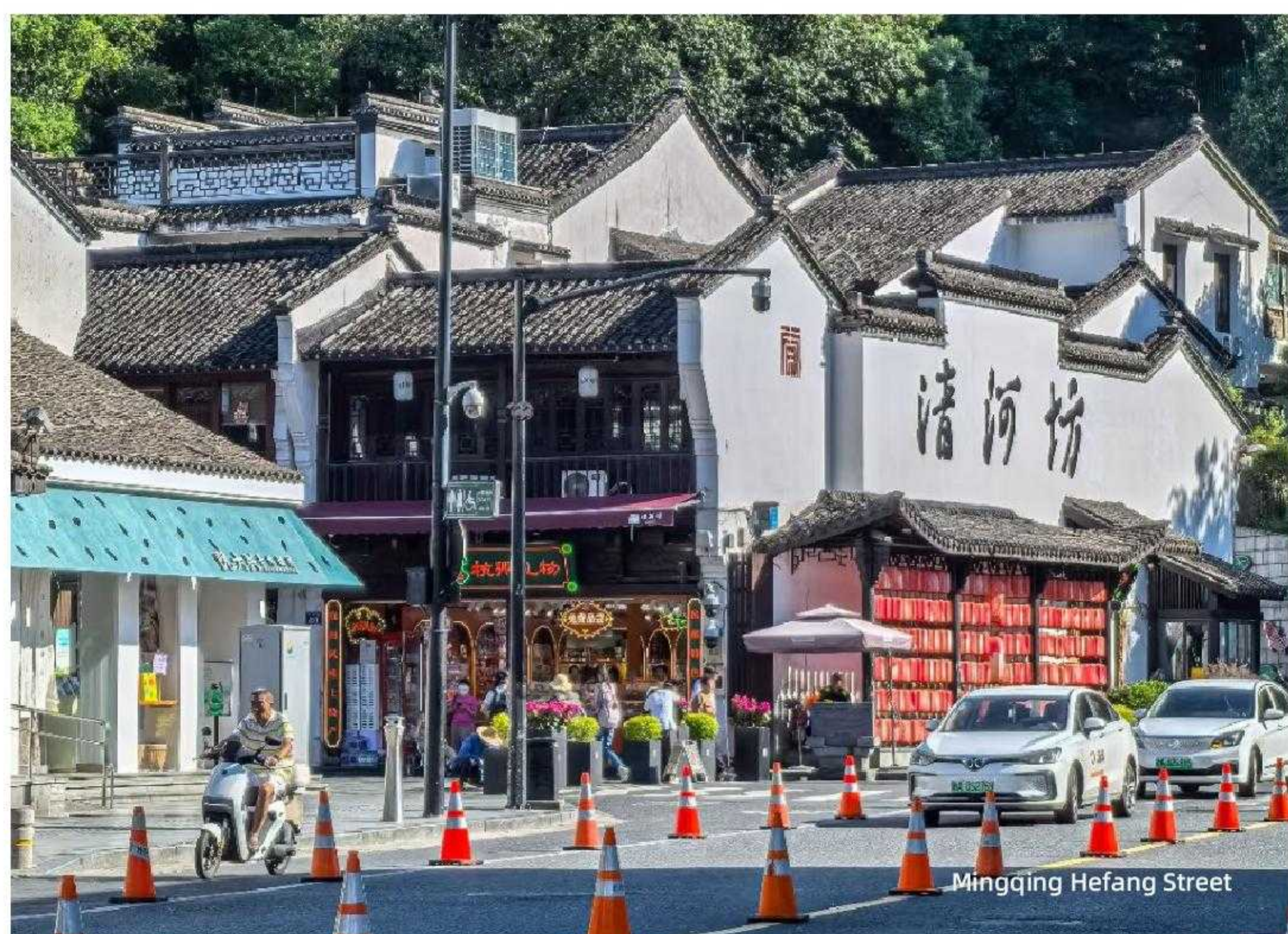
Mingqing Hefang Street

Hotel: Wuzhen Xizha Homestay or similar 4★