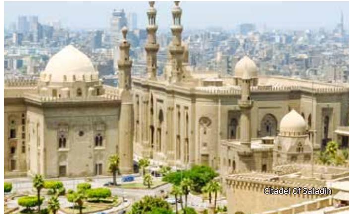
Citadel Of Saladin

Hotel: Sonesta Cairo Hotel or similar 4★