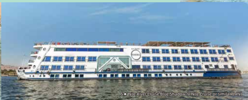
5★ Nile River Cruise Blue Shadow IV Nile Cruise or similar (4N)