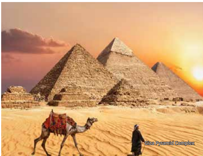
Giza Pyramid Complex

Hotel: Sonesta Cairo Hotel or similar 4★