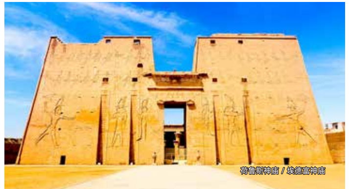
荷鲁斯神庙 / 埃德富神庙