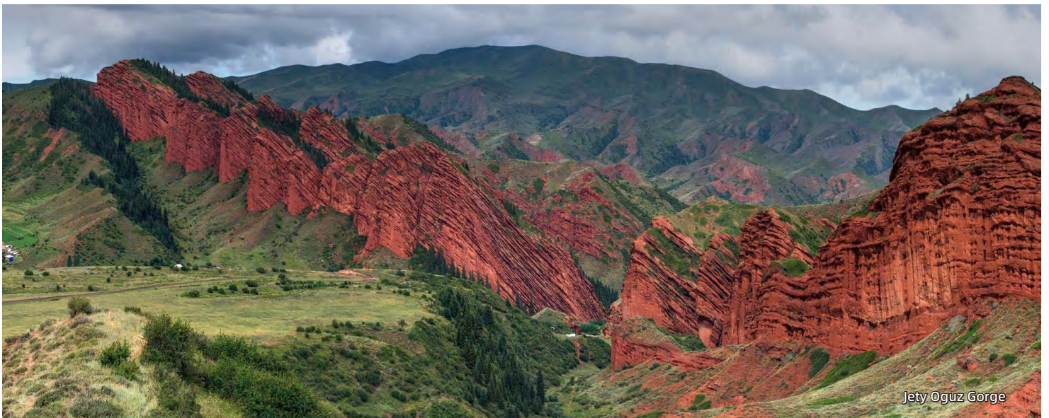
Jety Oguz Gorge