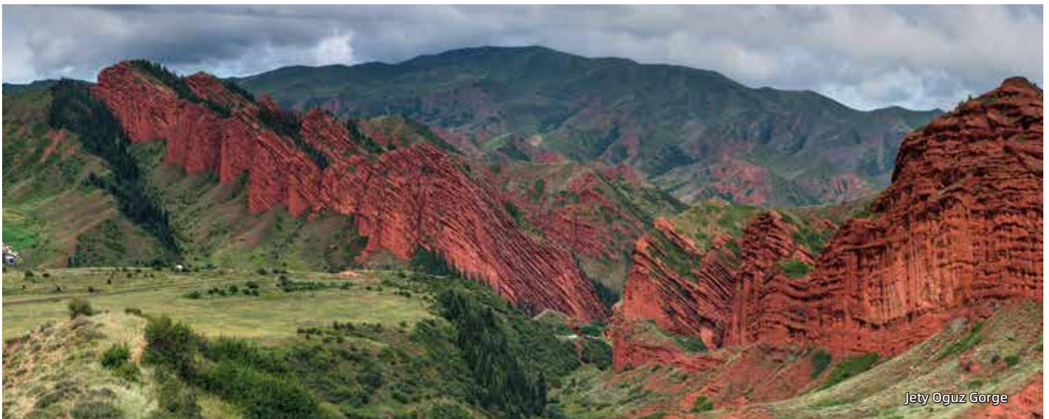
Jety Oguz Gorge