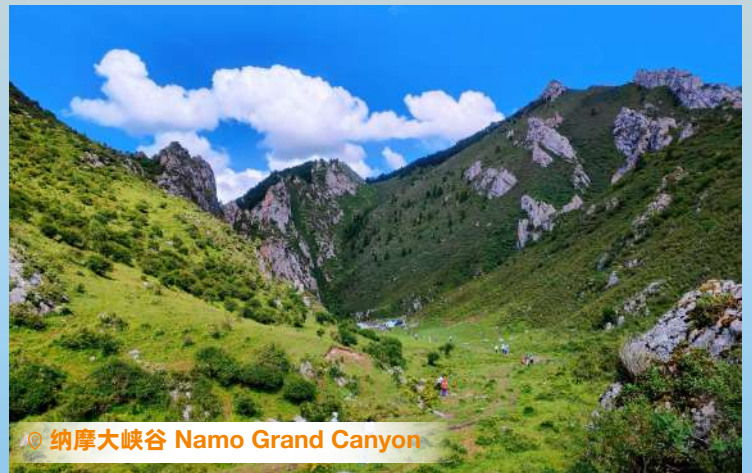
纳摩大峡谷 Namo Grand Canyon