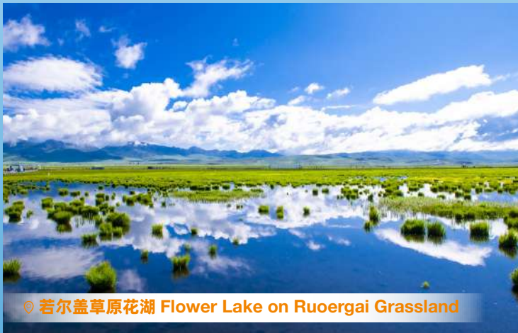
若尔盖草原花湖 Flower Lake on Ruergai Grassland