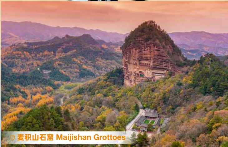
麦积山石窟 Maijishan Grottoes