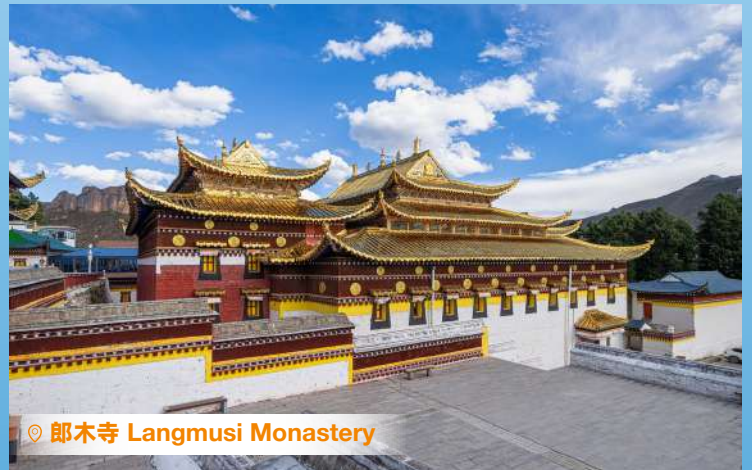
郎木寺 Langmusi Monastery