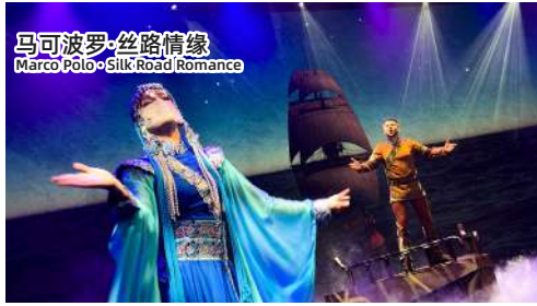
马可波罗·丝路情缘 Marco Polo · Silk Road Romance