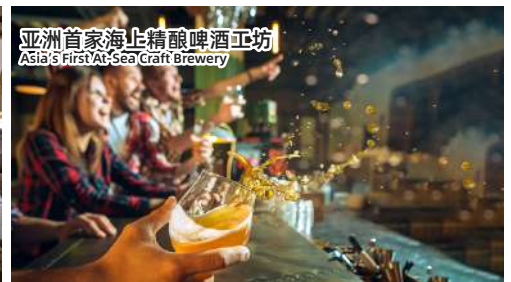
亚洲首家海上精酿啤酒工坊 Asia's First At-Sea Craft Brewery