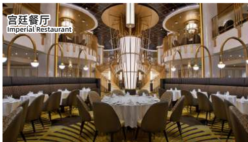
宫廷餐厅 Imperial Restaurant