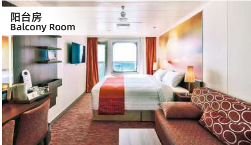
阳台房 Balcony Room