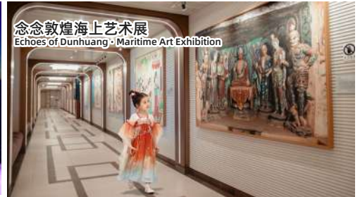
念念敦煌海上艺术展 Echoes of Dunhuang · Maritime Art Exhibition