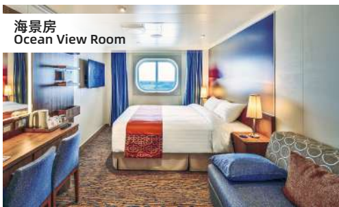
海景房 Ocean View Room