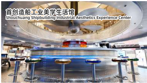
首创造船工业美学生活馆 Shouchuang Shipbuilding Industrial Aesthetics Experience Center