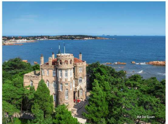
Ba Da Guan