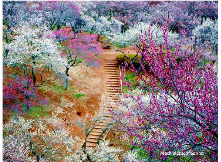
Peach Blossom Spring