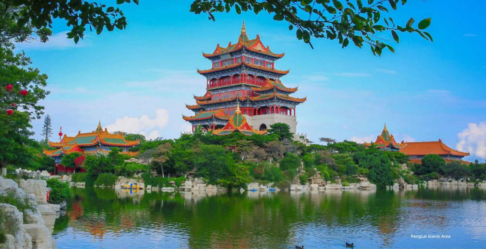
PengLai Scenic Area