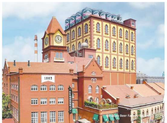
Qingdao Beer Factory